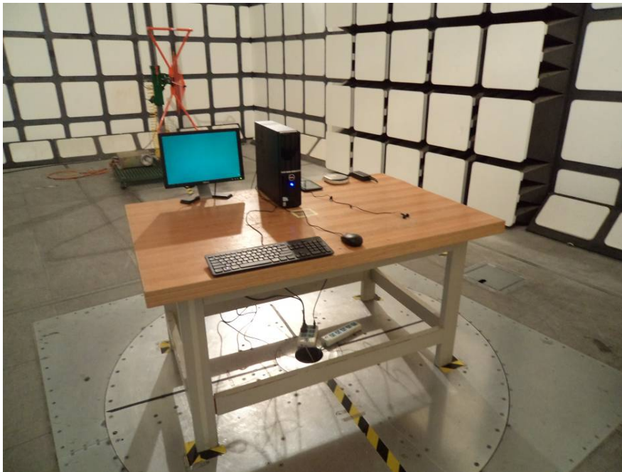
Radiated Emissions – Rear View (30~1000 MHz)