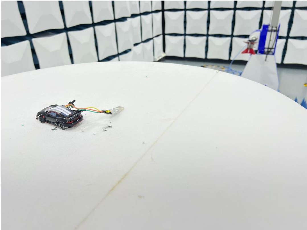
Set up for Radiated Emission Above 1GHz