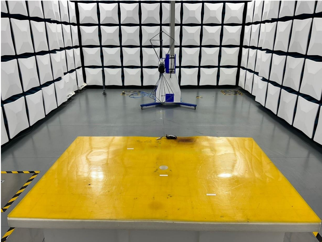
Set up for Radiated Emission 30M~200MHz