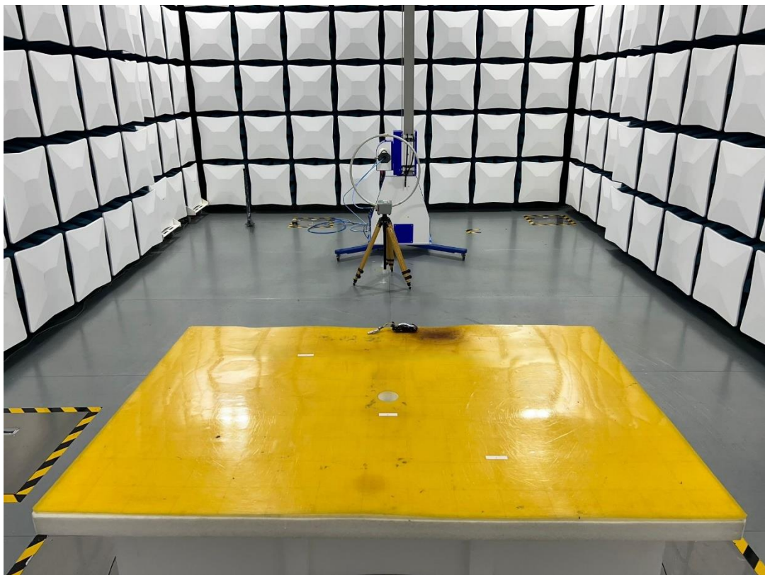
Set up for Radiated Emission Below 30MHz