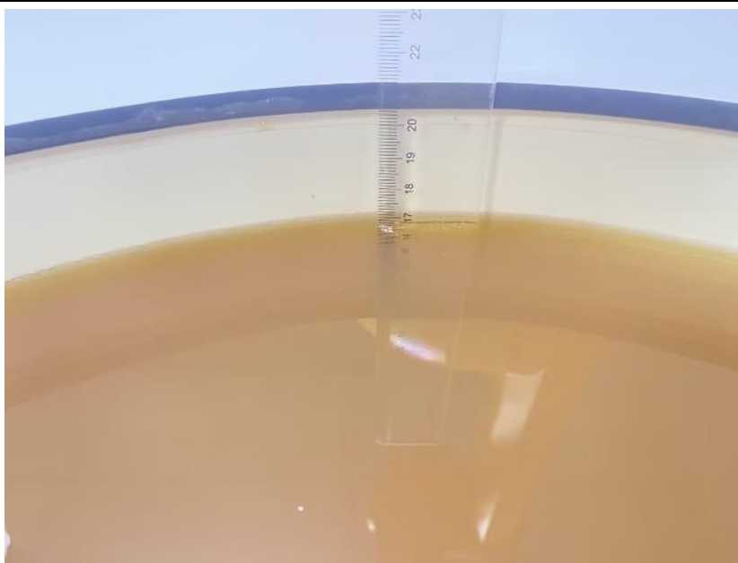
Tissue Simulant Liquid for Head 300MHz-6GHz