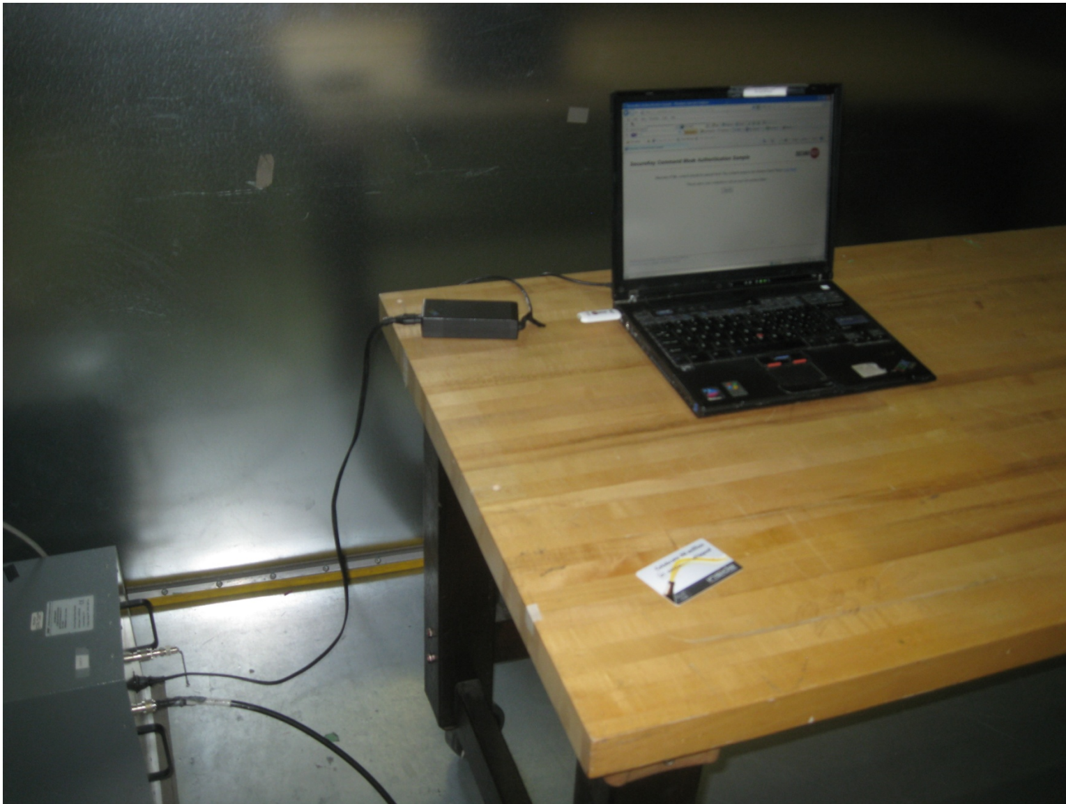
Power Line Conducted Emissions