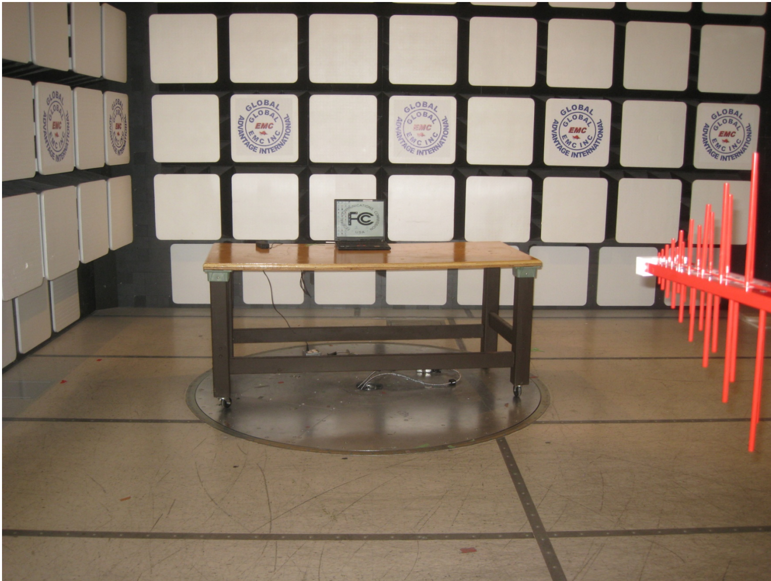
Radiated Emissions 30 MHz to 1 GHz