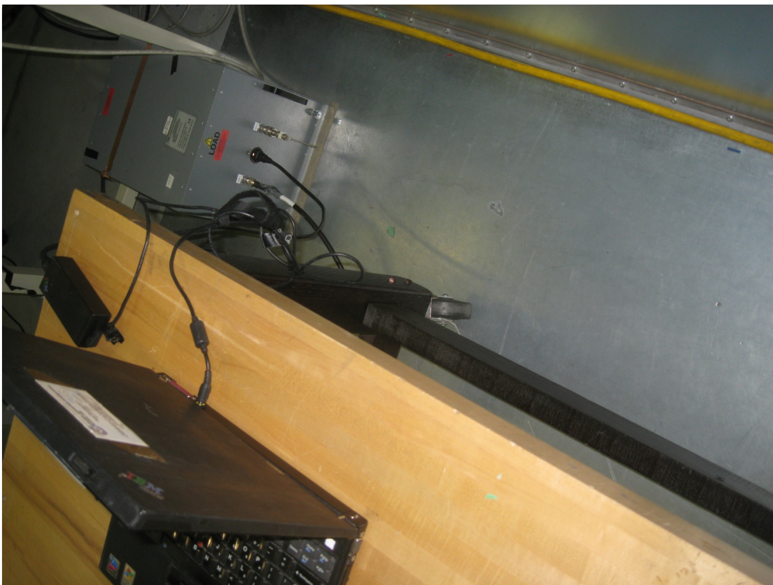
Power Line Conducted Emissions