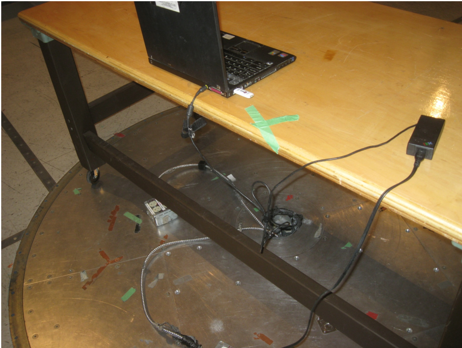
Radiated Emissions Close Up