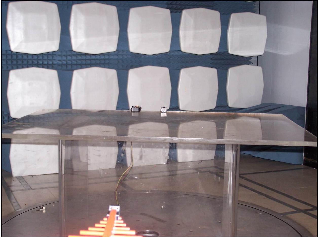
Photograph 1. Radiated Emissions, Test Setup