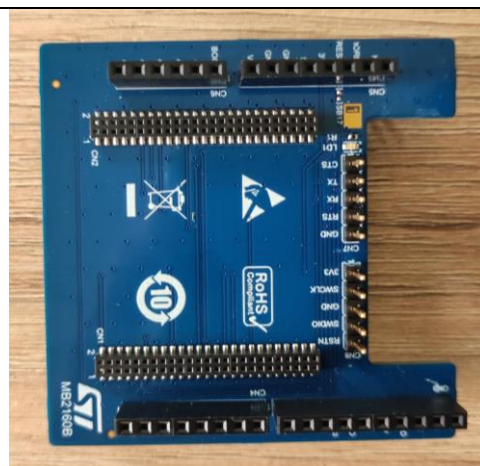
Top side of MB2160