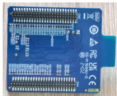
Rear side of MB2032B