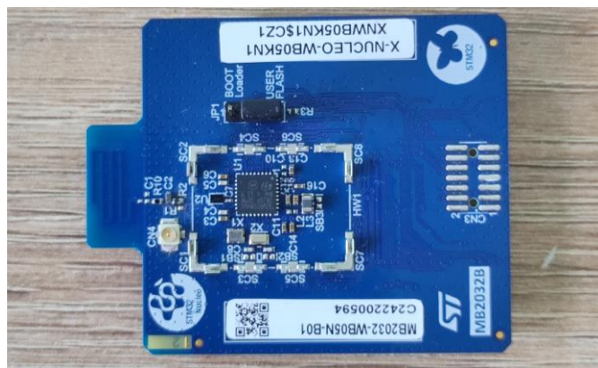
Cover removed (RF part)