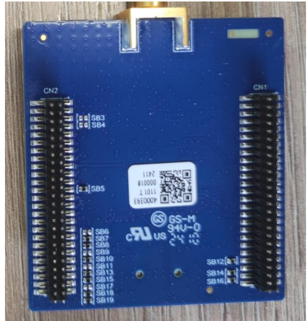
Rear side of MB2029B