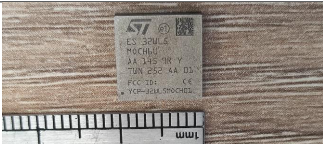
Marking is set on the top side of the module

Note : Because of the small size of the device, FCC and IC (ISED) numbers are placed in the user's manual and on the packaging.