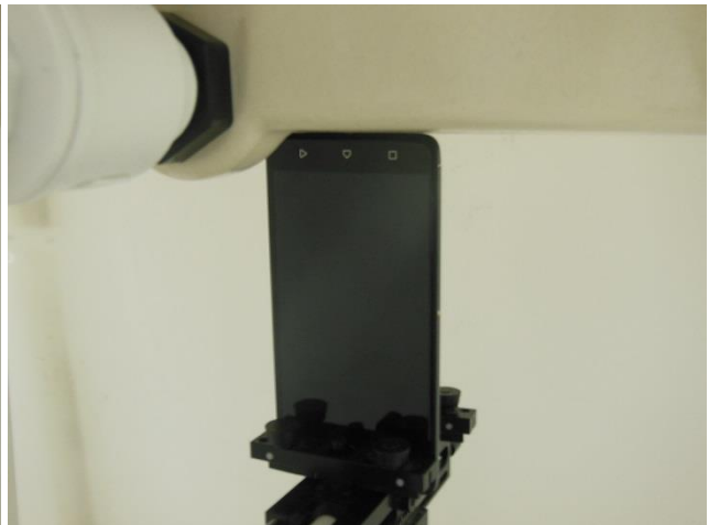
Bottom Side, Test Separation 0 mm