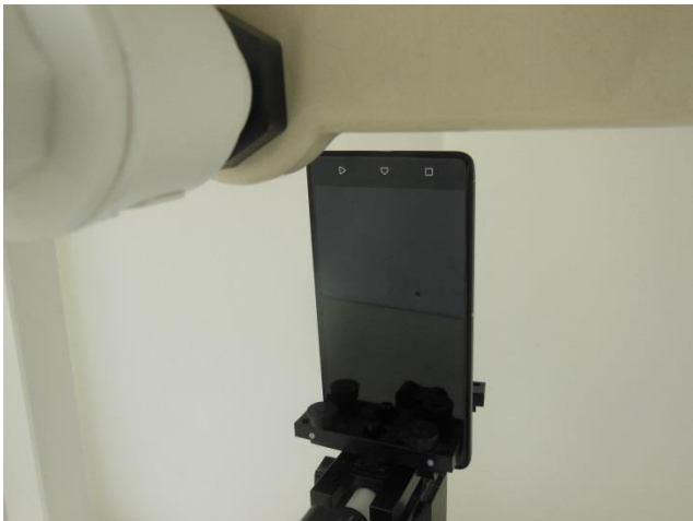
Bottom Side, Test Separation 10 mm