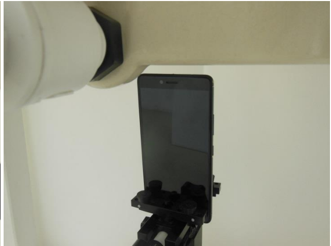
Top Side, Test Separation 10 mm