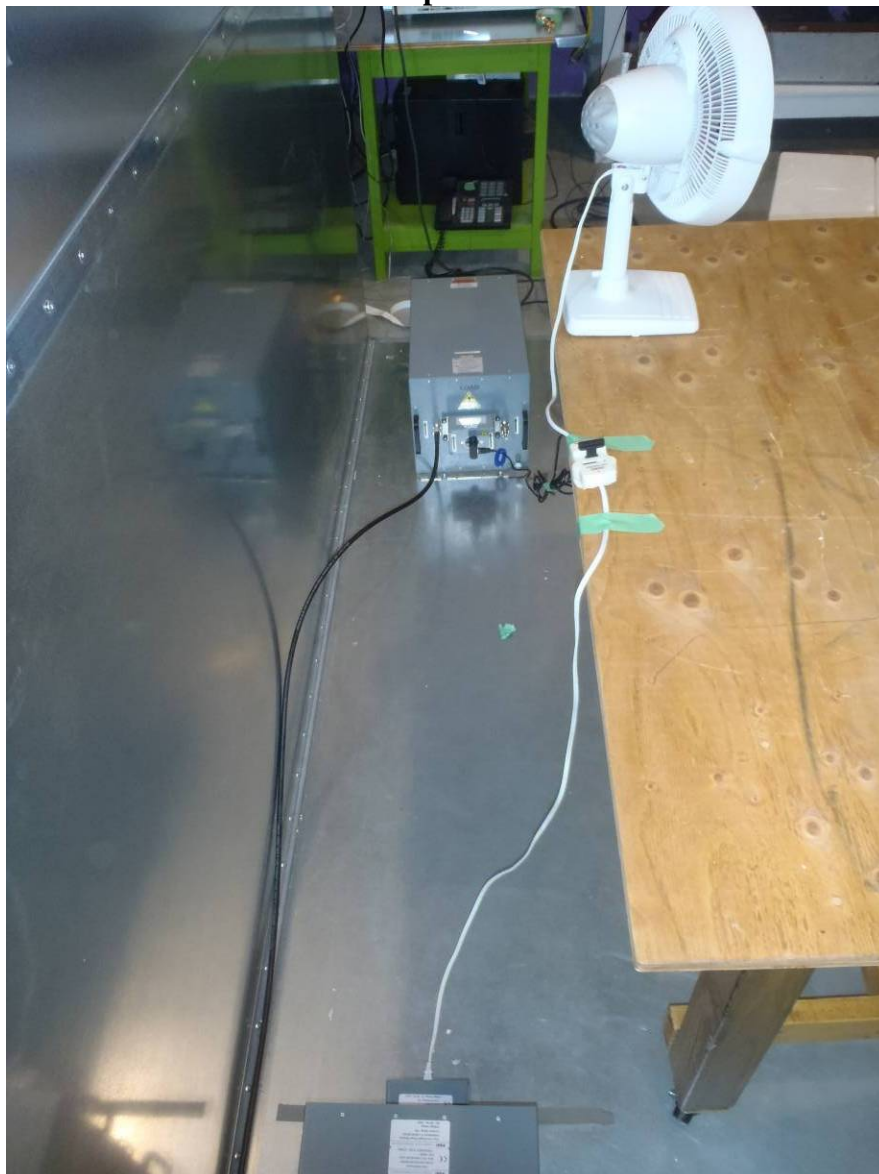
Conducted Emission Test Setup Photo#2: