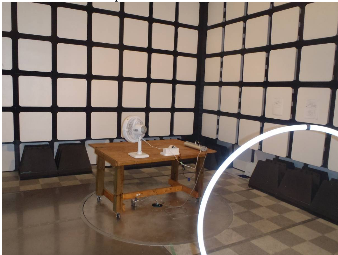
Radiated Emission Test Setup Photo #3: