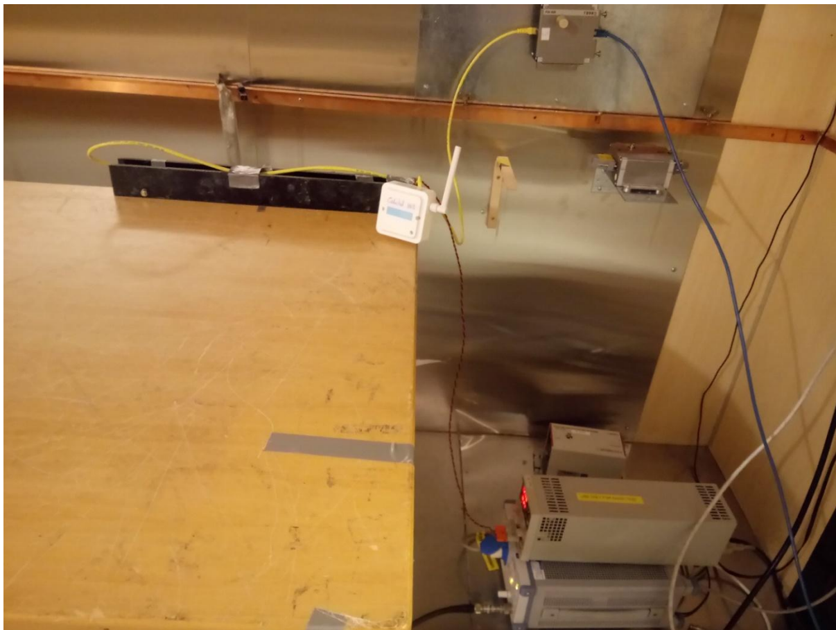
Conducted power emissions