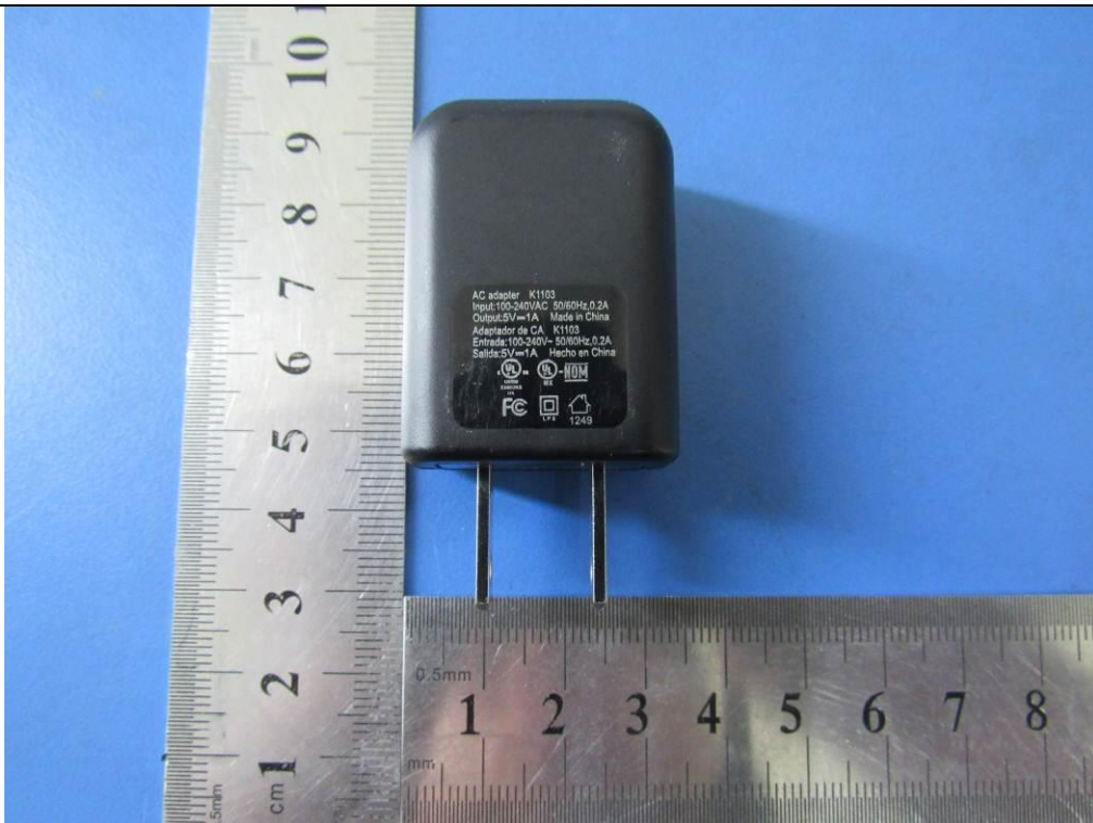
Adapter of EUT