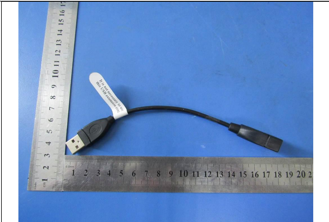
Cable of EUT