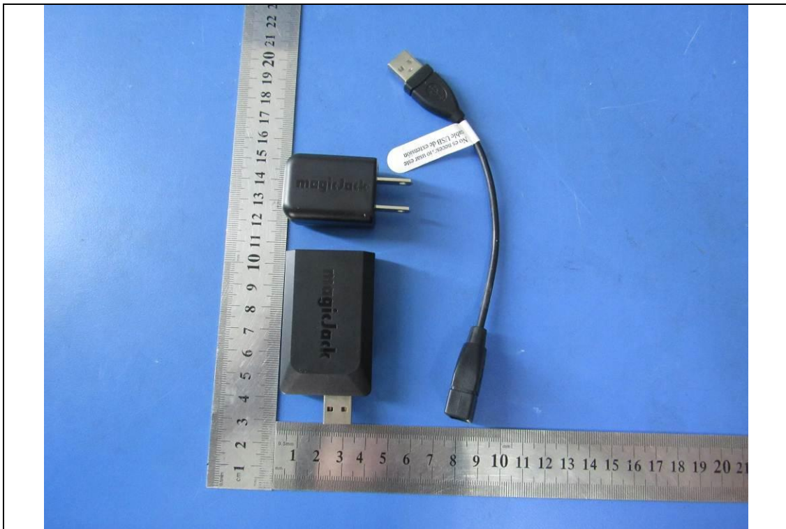
The Whole Package of EUT – Front View