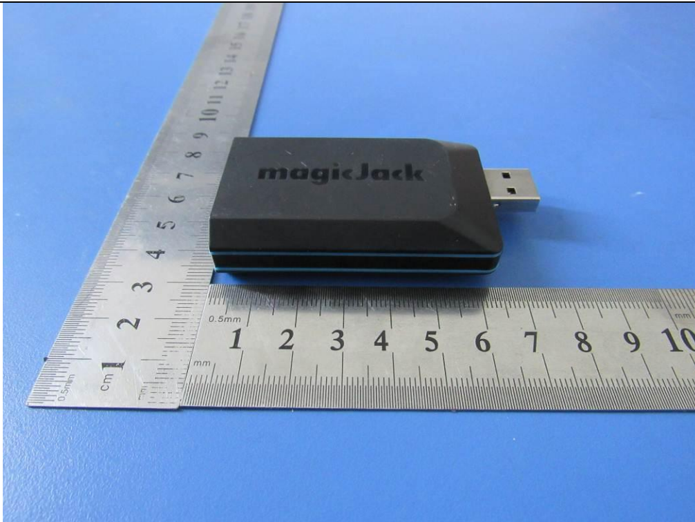
Left View of EUT