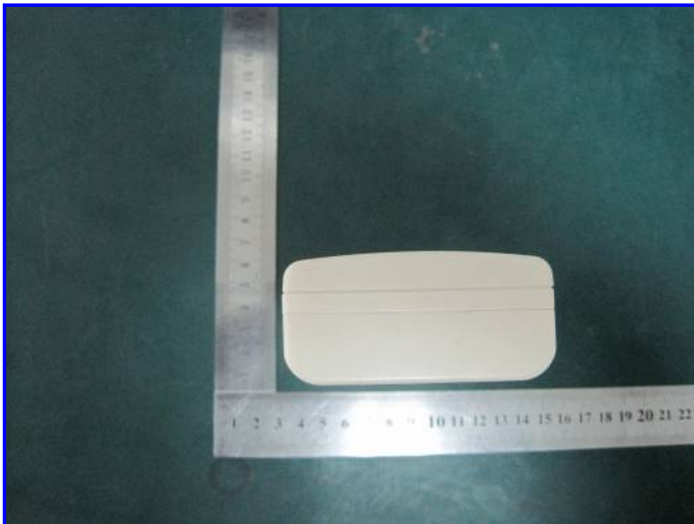
Bottom View of EUT