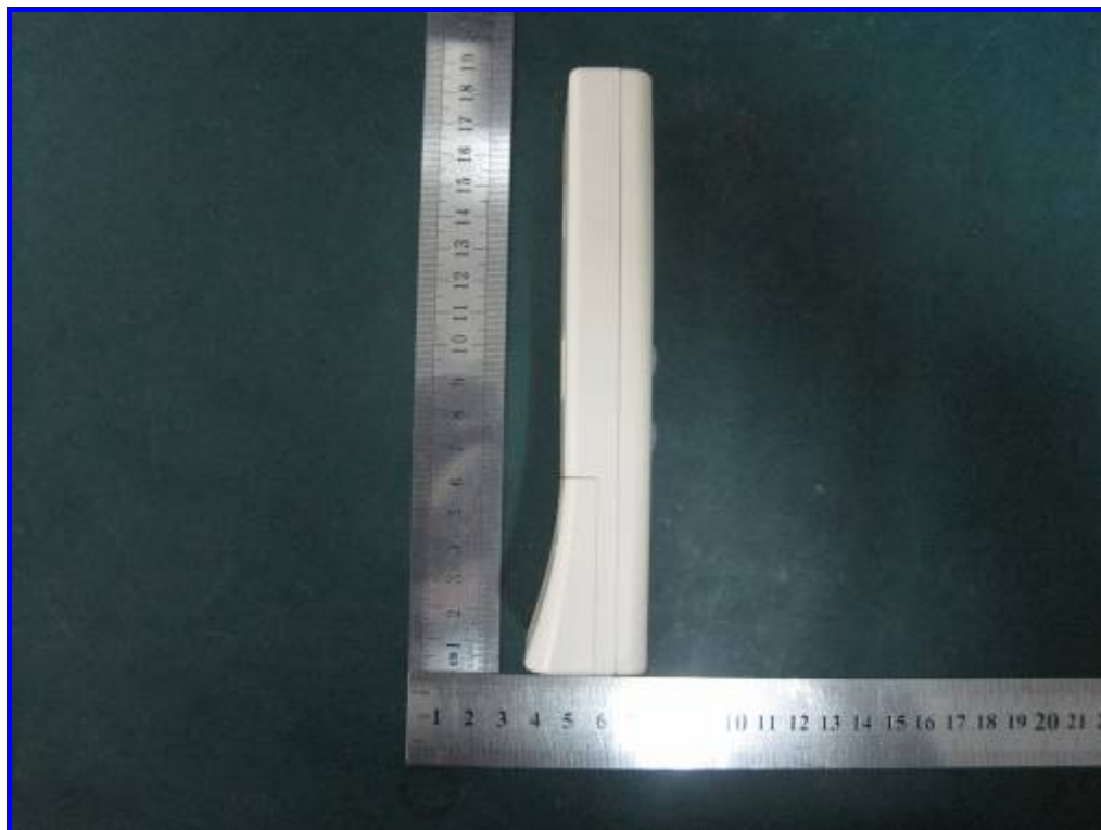
Left View of EUT