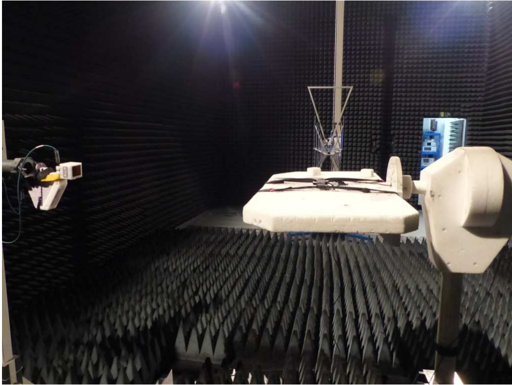
Photo 4: Test setup for radiated measurements (Enclosure, fully-anechoic chamber, 18-25 GHz, intentional radiator § 15.247)