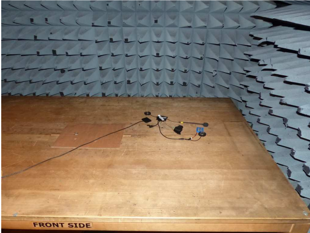
Photo 1: Test setup for radiated measurements (Enclosure, below 30 MHz, intentional radiator §15)