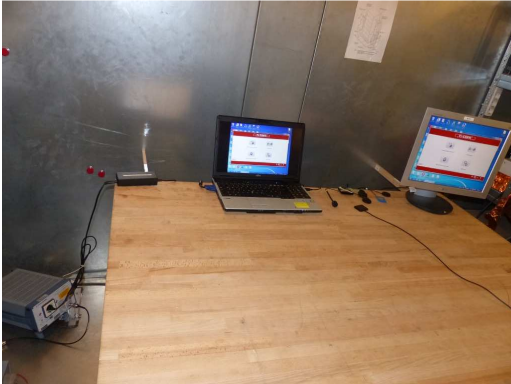
Photo 5: Test setup for conducted measurements (computer peripheral setup, EUT supplied by USB-cable from computer, charging mode, unintentional radiator §15)