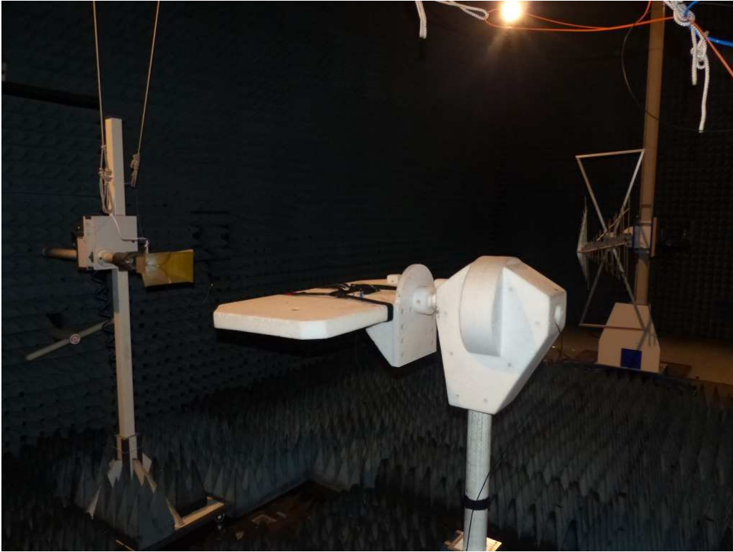
Photo 3: Test setup for radiated measurements (Enclosure, fully-anechoic chamber, 1-18 (15) GHz intentional radiator §15)