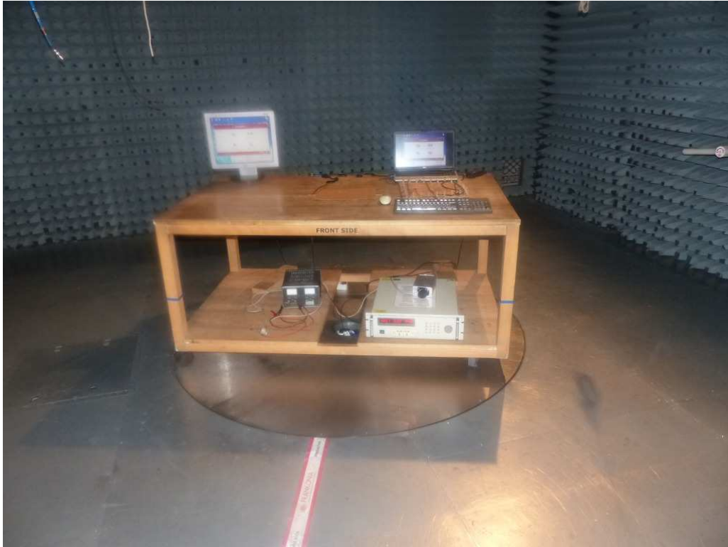
Photo 6: Test setup for radiated measurements (computer peripheral setup, EUT supplied by external DC power to enable USB data transfer to computer, unintentional radiator §15)