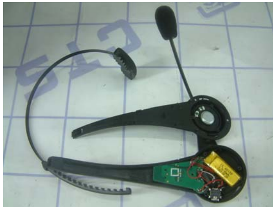
Internal view 2