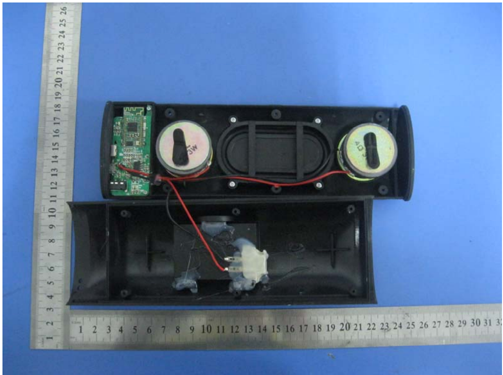
EUT – Uncover Front View