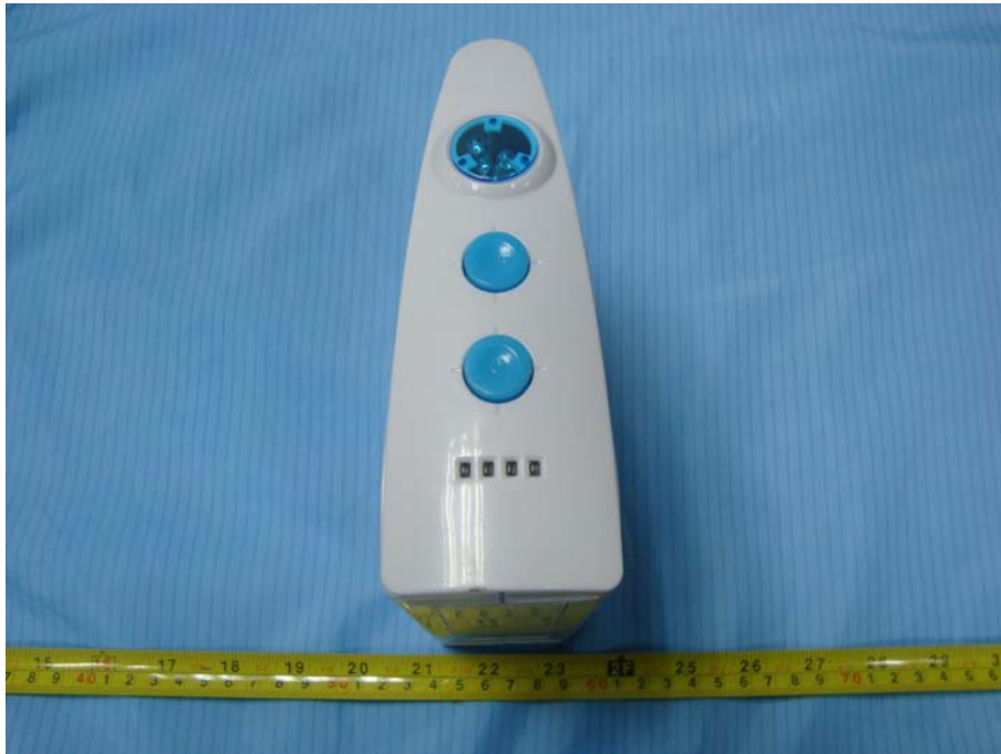
EUT – Rear View