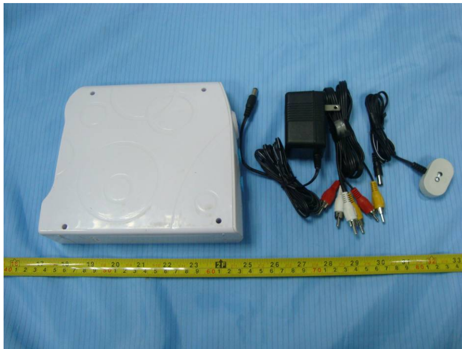
EUT – Side View 1