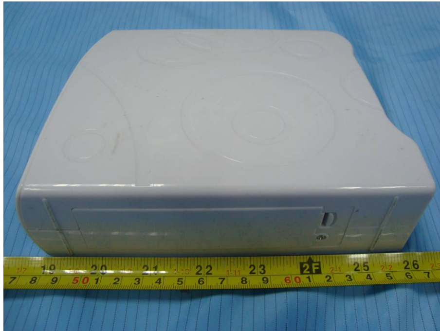
EUT – AC/DC Adapter View