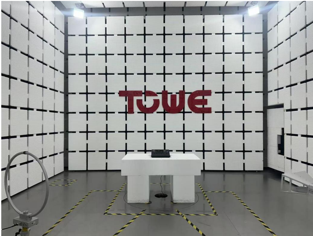
Radiated Spurious Emissions (9kHz to 30MHz)