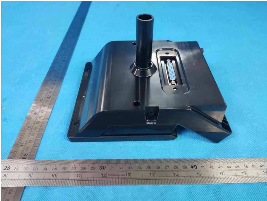
View of The Product