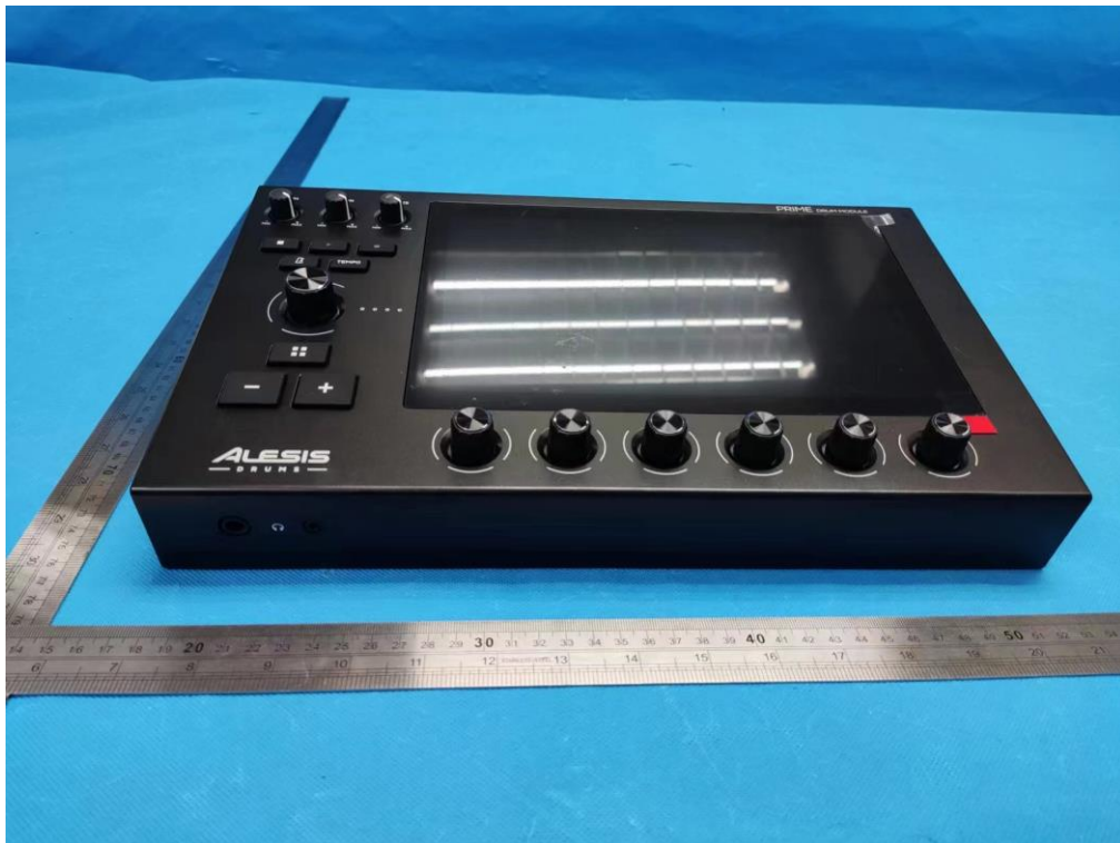
View of The Product