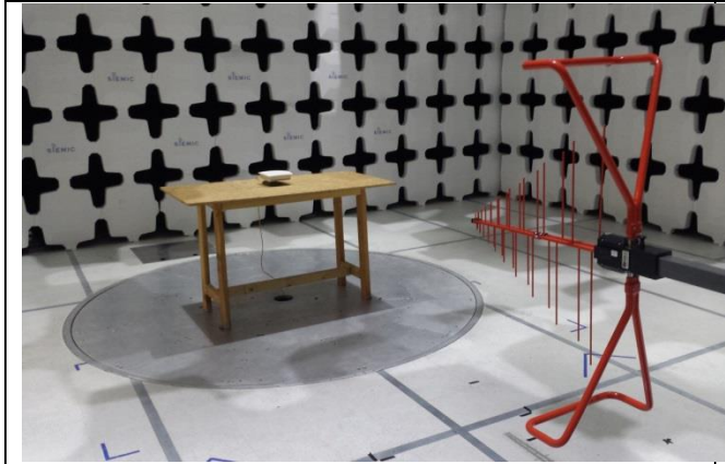
Radiated Emissions (<1GHz) – Front View