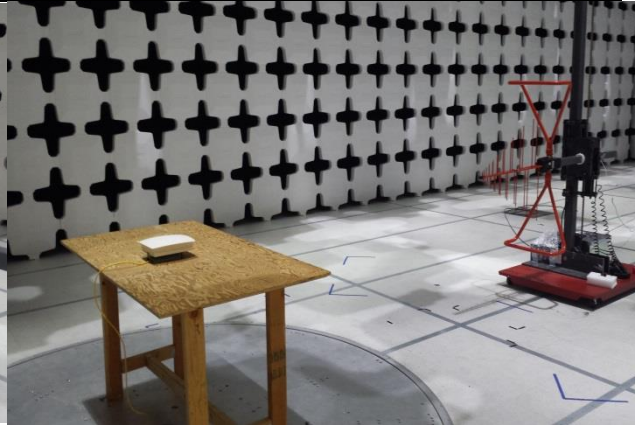
Radiated Emissions (<1GHz) – Rear View