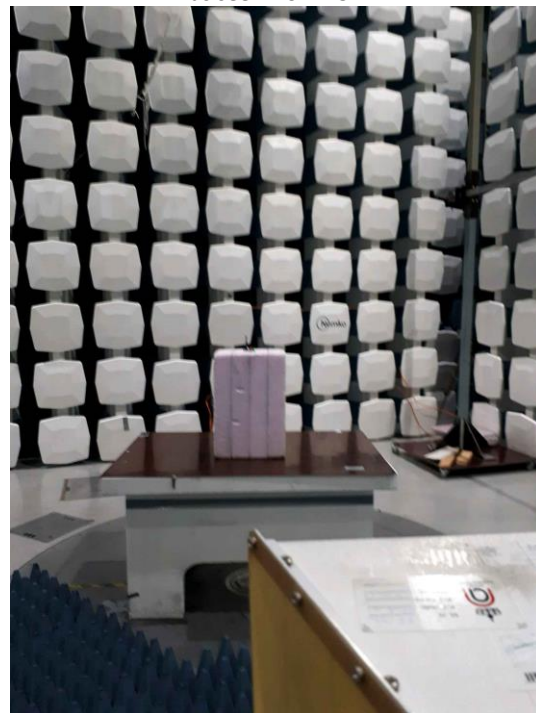
Radiated Emissions, 1 GHz – 10 GHz, as seen from antenna