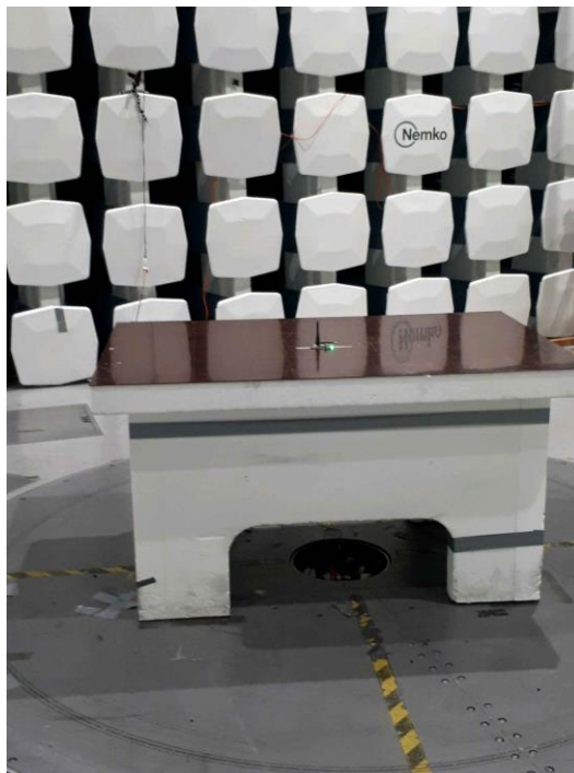
Radiated Emissions, 30 - 1000 MHz, as seen from antenna