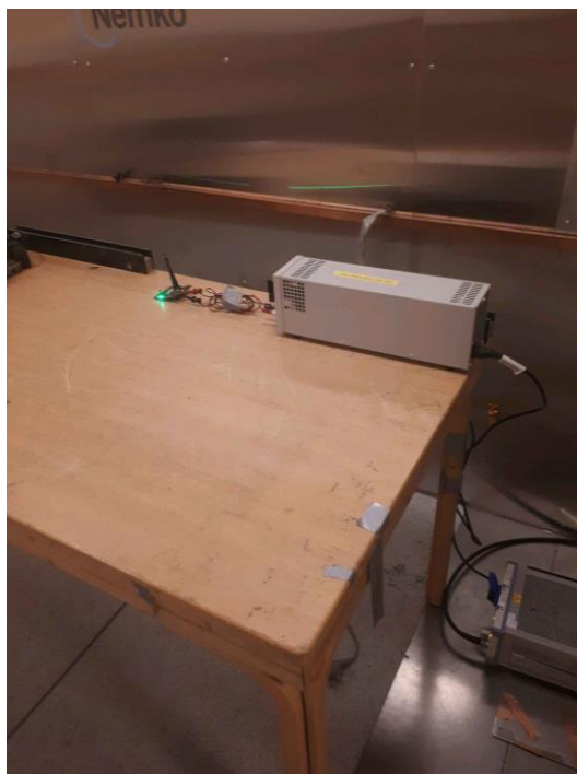
Power line Conducted Emissions Test