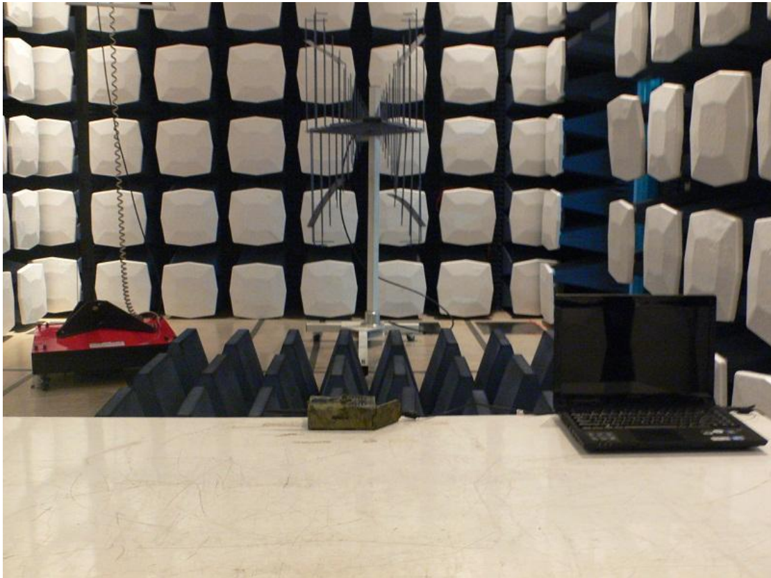
Radiated Out of Band Emissions