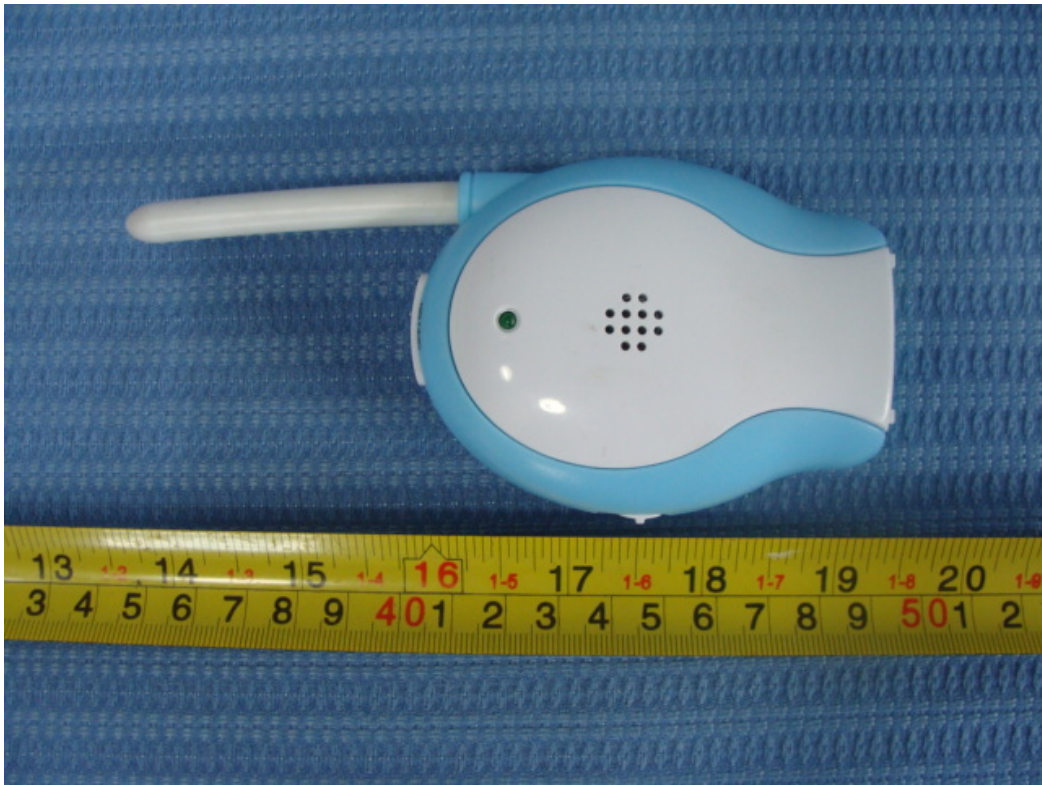
Photo for the EUT-TX