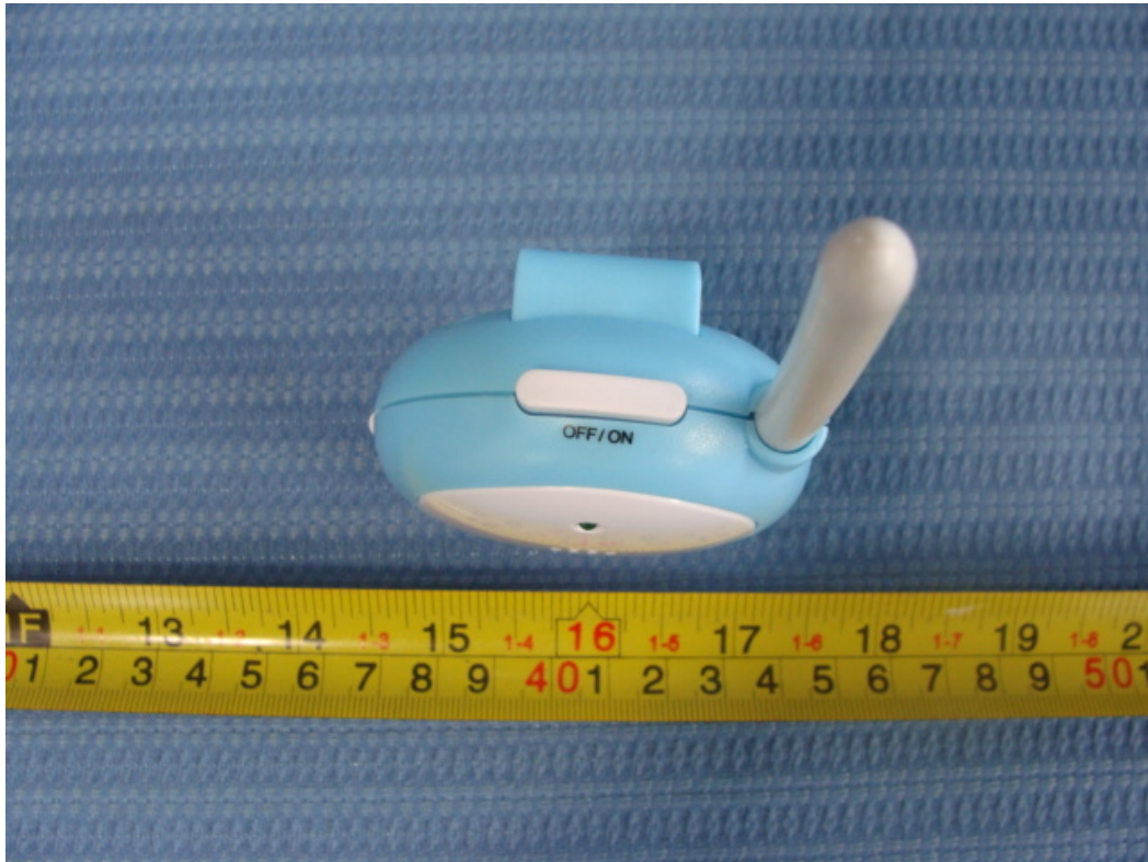
Photo for the EUT-TX

The report refers only to the sample tested and does not apply to the bulk.