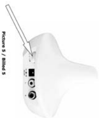
Picture 5 / Billed 5

5. Choose the Channel you want to use option 1, 2 or 3 (see pic. 5) Vælg den kanal du ønsker at anvende ved hjælp af 1, 2 eller 3 (se Billed 5)