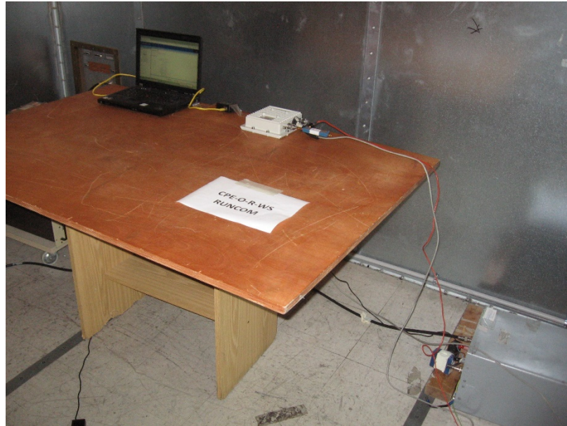
Figure 1. Conducted Emission Test