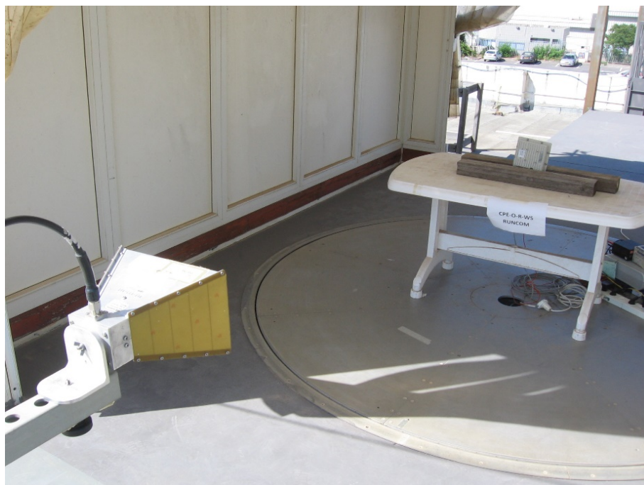
Figure 4. Spurious Radiated Emission Test – 1GHz-7GHz