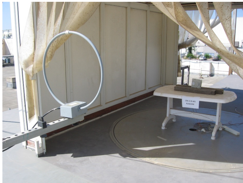
Figure 2. Spurious Radiated Emission Test – 9kHz-30MHz