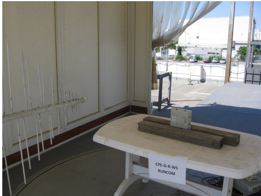
Figure 3. Spurious Radiated Emission Test – 30MHz-1GHz