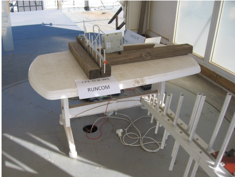
Figure 5. Spurious Radiated Emission Test – 602MHz-628MHz