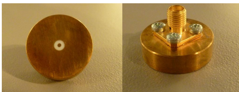
Figure 1 – MVG LIMESAR Dielectric Probe

MVG's Dielectric Probes are built in accordance to the IEEE 1528 and CEI/IEC 62209 standards. The product is designed for use with the LIMESAR test bench only.