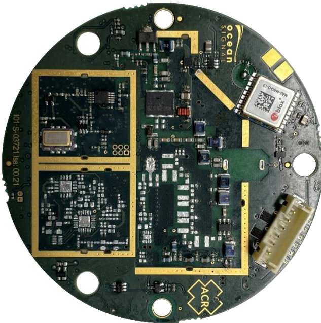
Figure 5: EPIRB2/EPIRB2 Pro PCB – Rear side with screening cans removed.