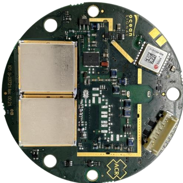
Figure 4: EPIRB2/EPIRB2 Pro PCB – Rear side.