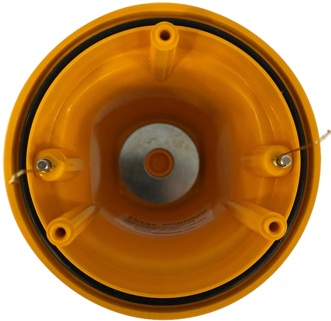
Figure 3: EPIRB2/EPIRB2 Pro – Top view, case only.