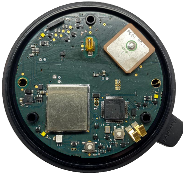
Figure 1: EPIRB2/EPIRB2 Pro – Top view showing PCB in-situ.

Photographs showing the internal construction, battery pack and PCB assembly of the Ocean Signal EPIRB2 and EPIRB2 Pro are shown in Figures 1 to 6 below. Note that the internal construction, battery pack and PCB of both EPIRB variants is identical.