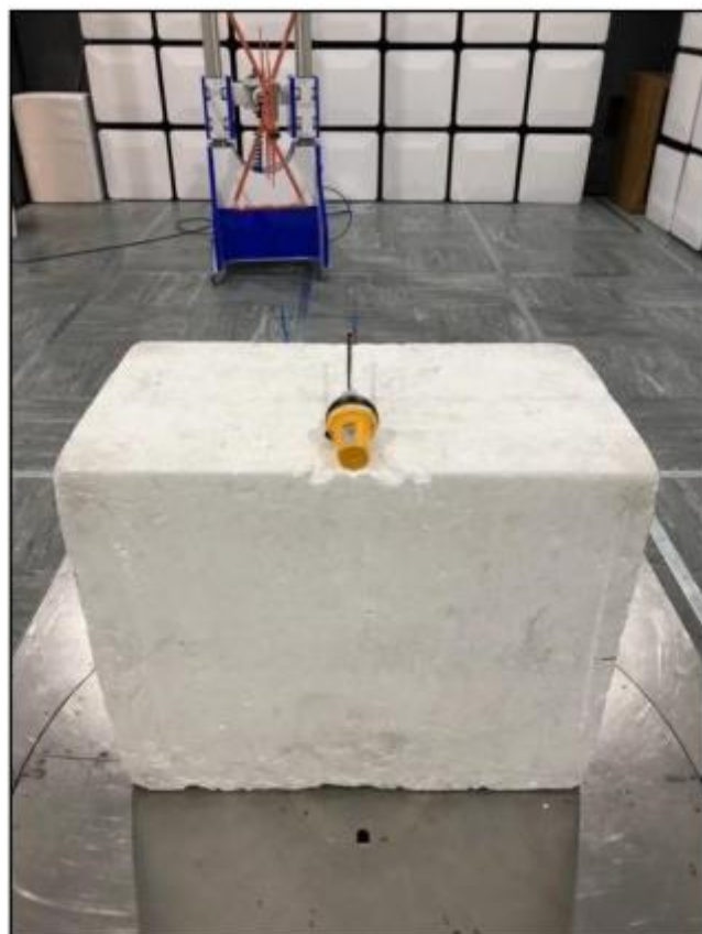
30 MHz to 1 GHz, X Orientation