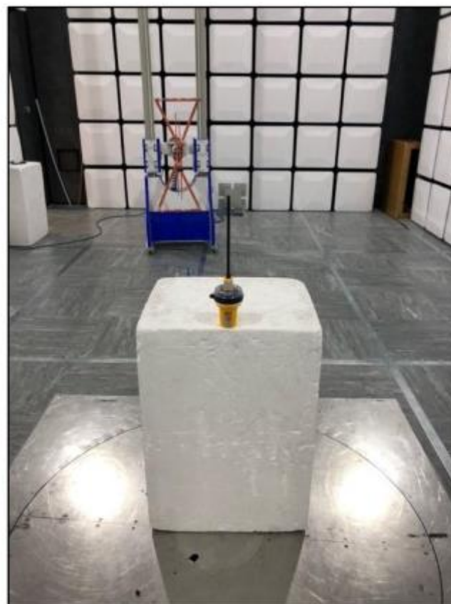
30 MHz to 1 GHz, Y Orientation