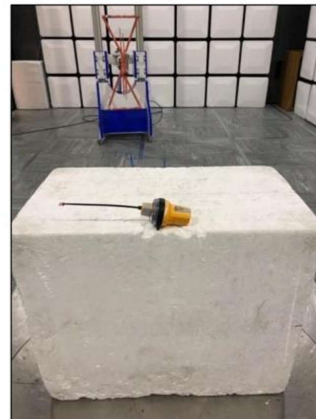
30 MHz to 1 GHz, Z Orientation