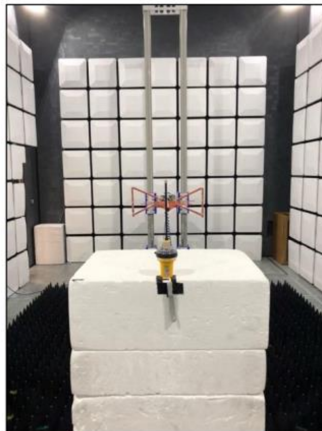
1 GHz to 2 GHz, Y Orientation