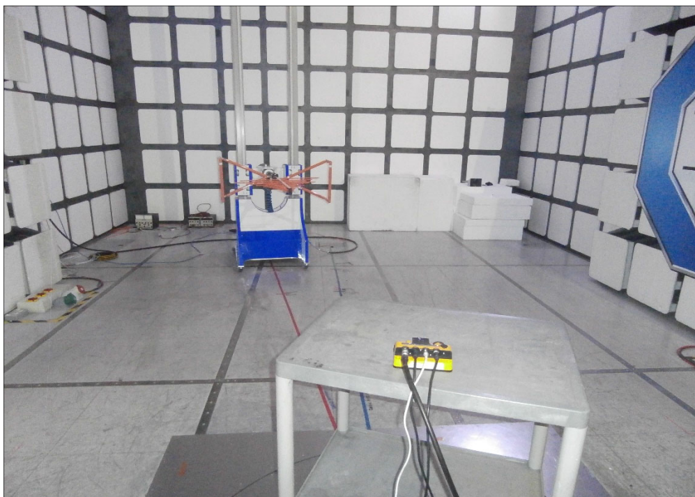
Figure 6 - Test Setup - Radiated Emissions 30 MHz to 1 GHz