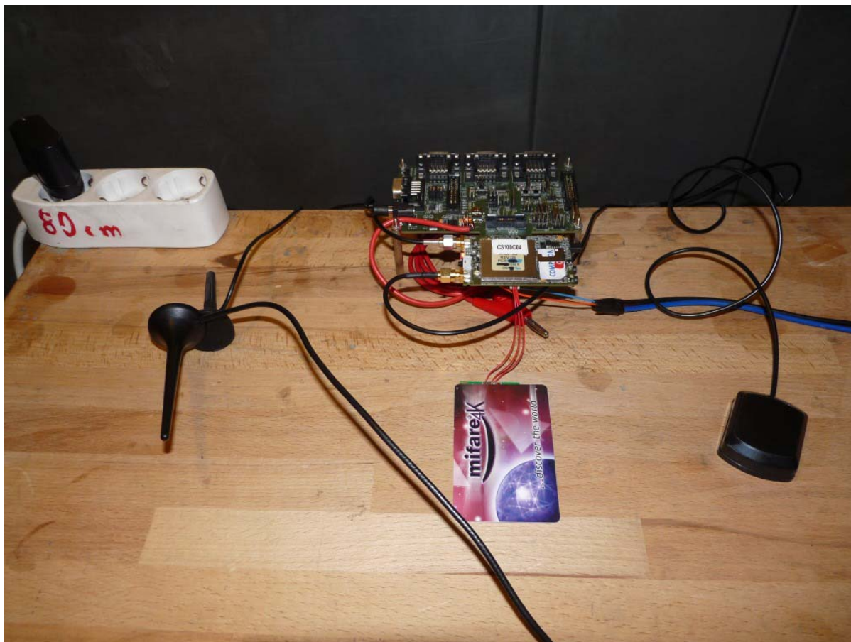
Test setup fo conducted measurements (AC line)