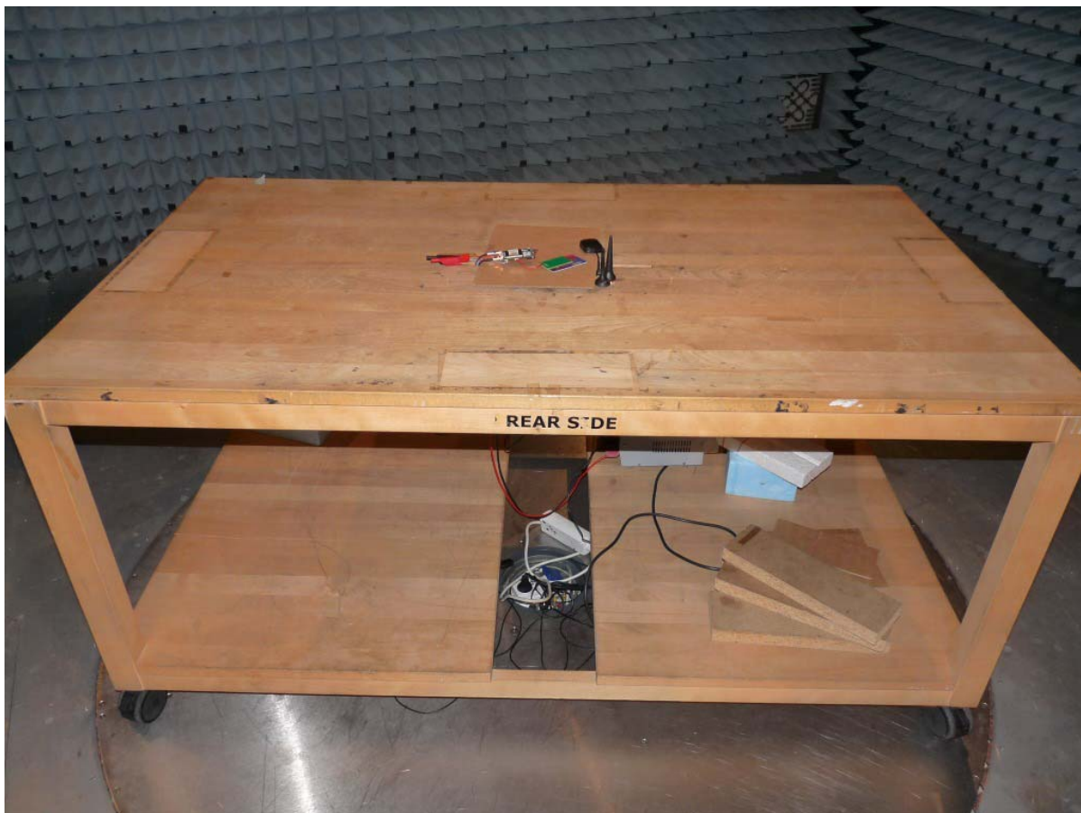
Test setup for radiated measurements