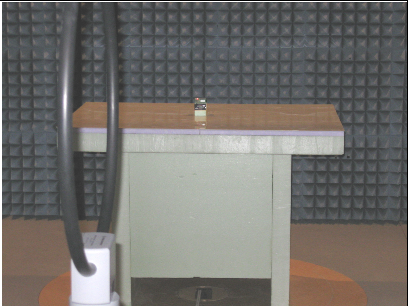
Figure 4: Measurement set-up for radiated measurement < 30 MHz acc. following sections of the report 1234-09-EE-10-PB006: 4.6