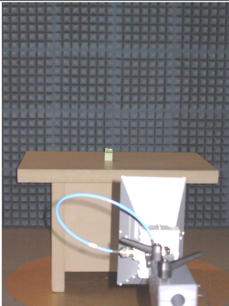
Figure 3: Measurement set-up for radiated measurement > 1 GHz acc. following sections of the report 1234-09-EE-10-PB006: 4.4.2 and 4.5.2