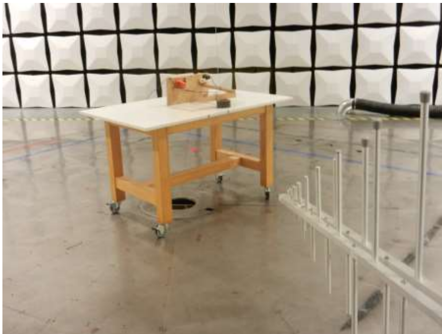
Figure 9: 30 MHz – 1 GHz: EUT flat on table