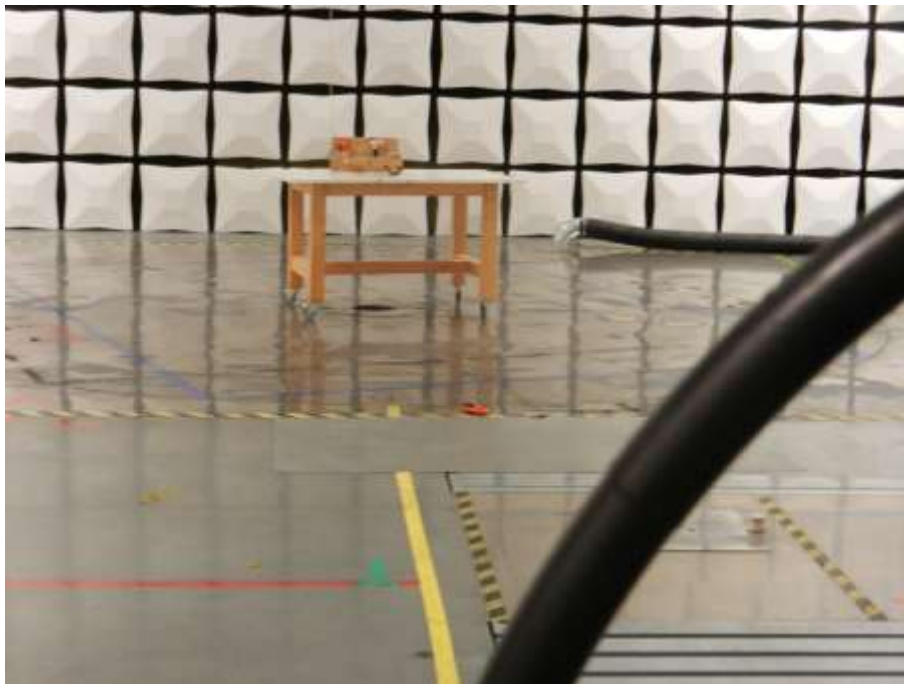
Figure 4: 9 kHz – 30 MHz: EUT flat on table