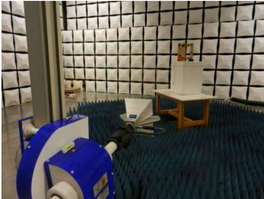
Figure 13: > 1 GHz: EUT on long side