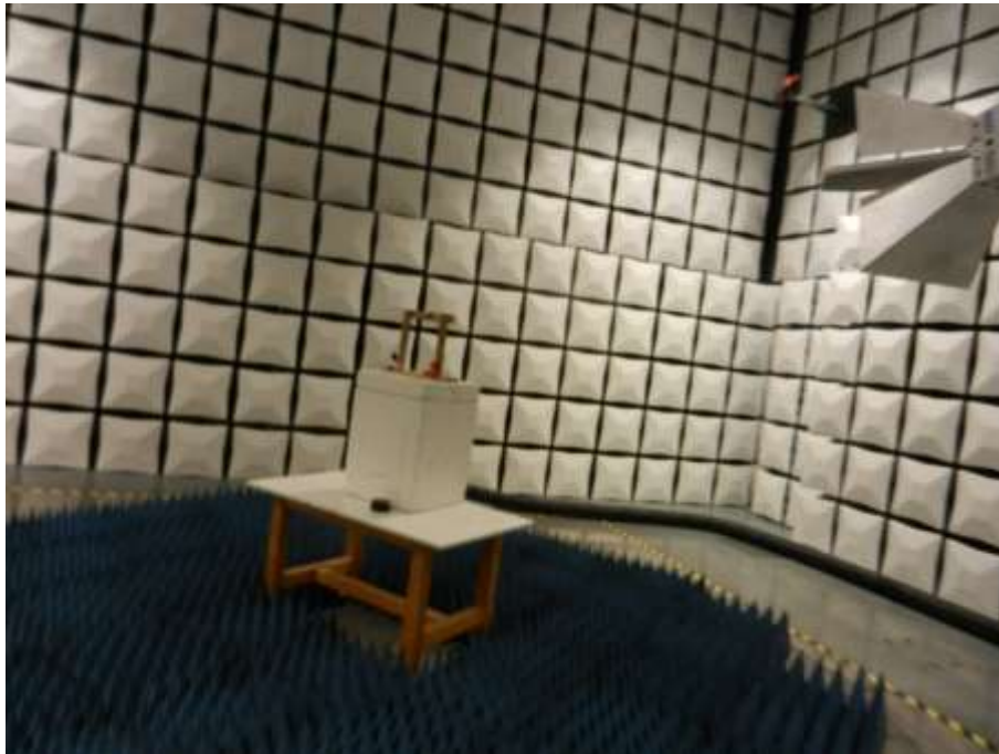
Figure 11: > 1 GHz: EUT in upright position