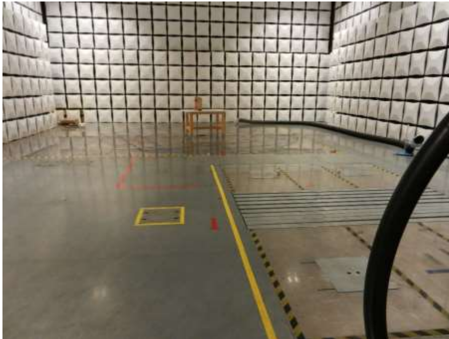
Figure 6: 9 kHz – 30 MHz: EUT on long side