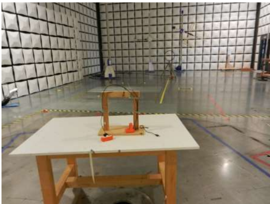
Figure 3: 9 kHz – 30 MHz: EUT in upright position