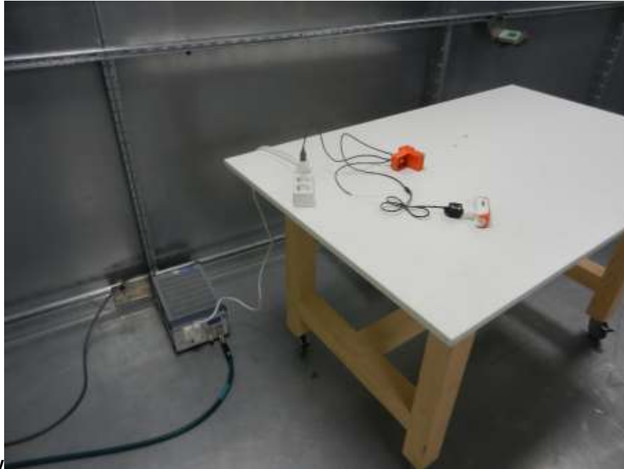
Figure 1: Conducted power line emissions