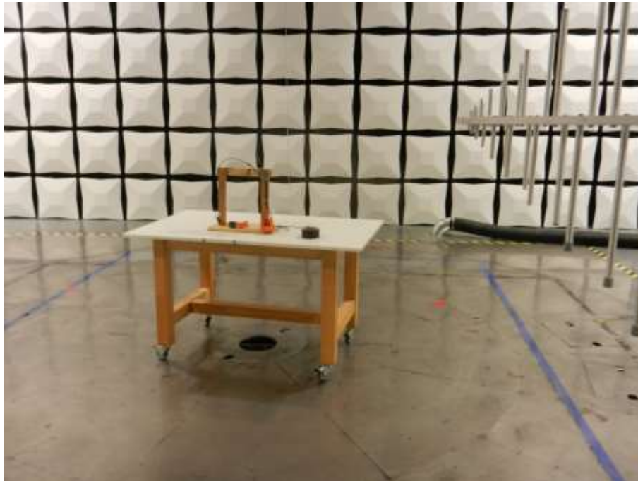
Figure 8: 30 MHz – 1 GHz: EUT in upright position