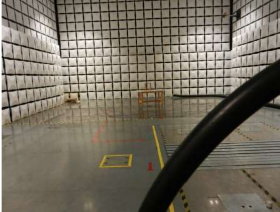
Figure 2: 9 kHz – 30 MHz: EUT in upright position