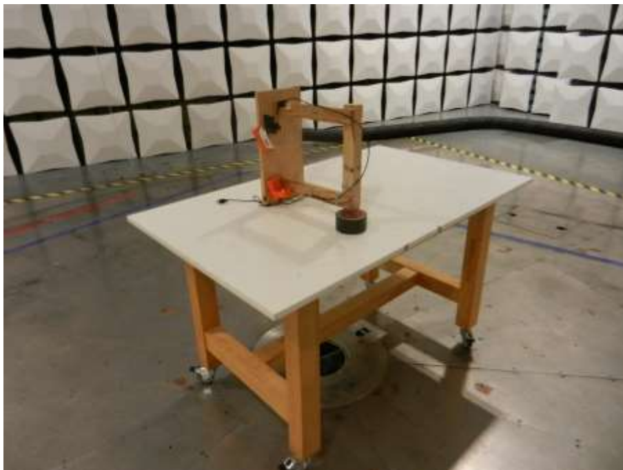
Figure 7: 9 kHz – 30 MHz: EUT on long side