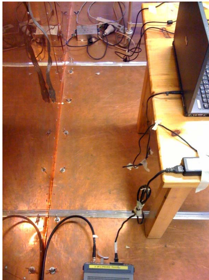
Conducted emission from AC mains