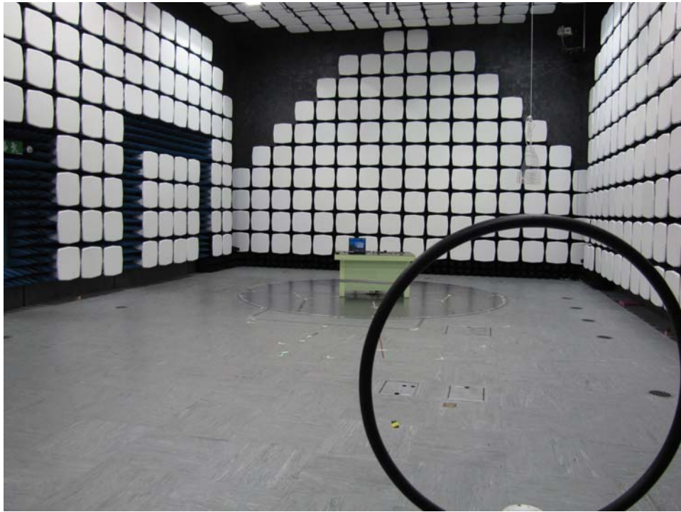
Radiated spurious emission 9 kHz – 30 MHz