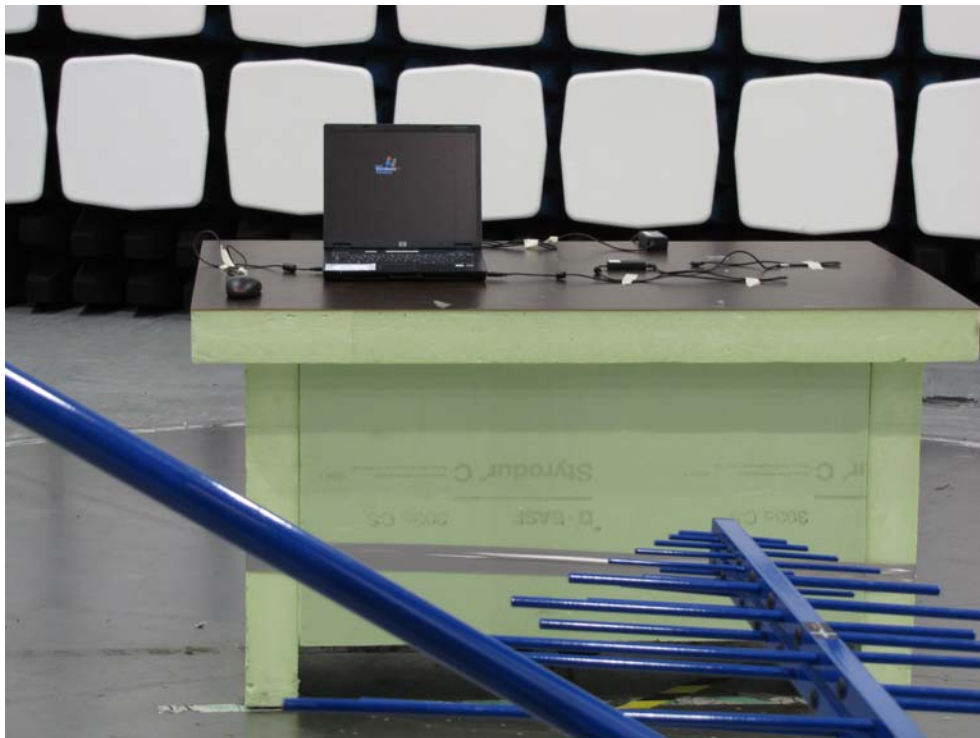
Radiated spurious emission 30 – 1000 MHz