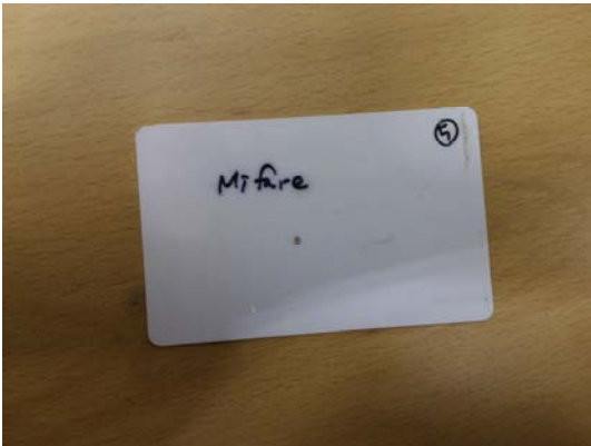
Card Mifare type view