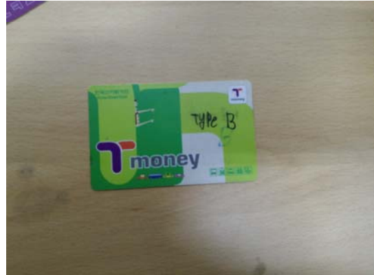
Card B type view