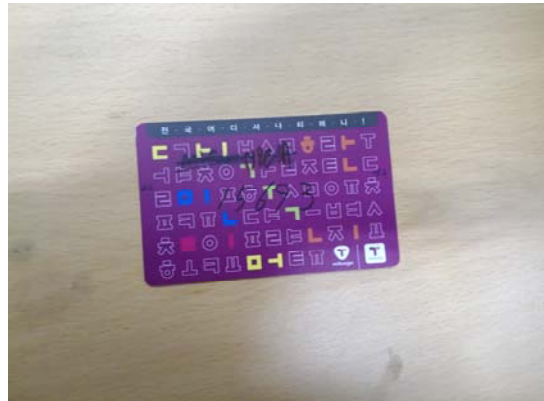
Card 15693 type view