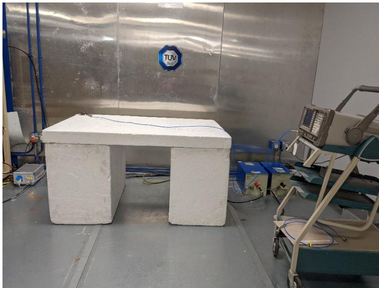
Figure-4 – Test Set up – Conducted emissions