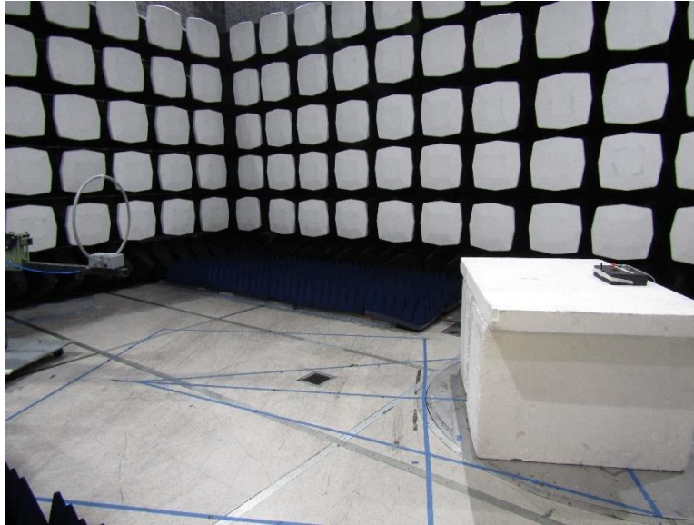
Figure-1 – Test Set up - Radiated Emissions <30 MHz