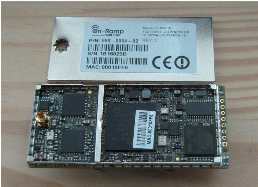
Figure 3: ENODE ULPN110 TOP SIDE (SHIELD REMOVED)