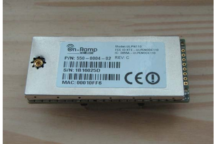
Figure 2: ENODE ULPN110 TOP SIDE