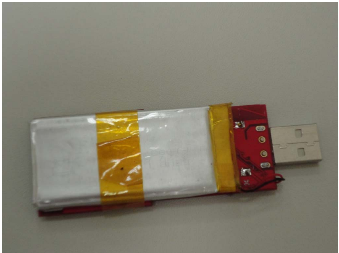
Bottom of Board: With Battery