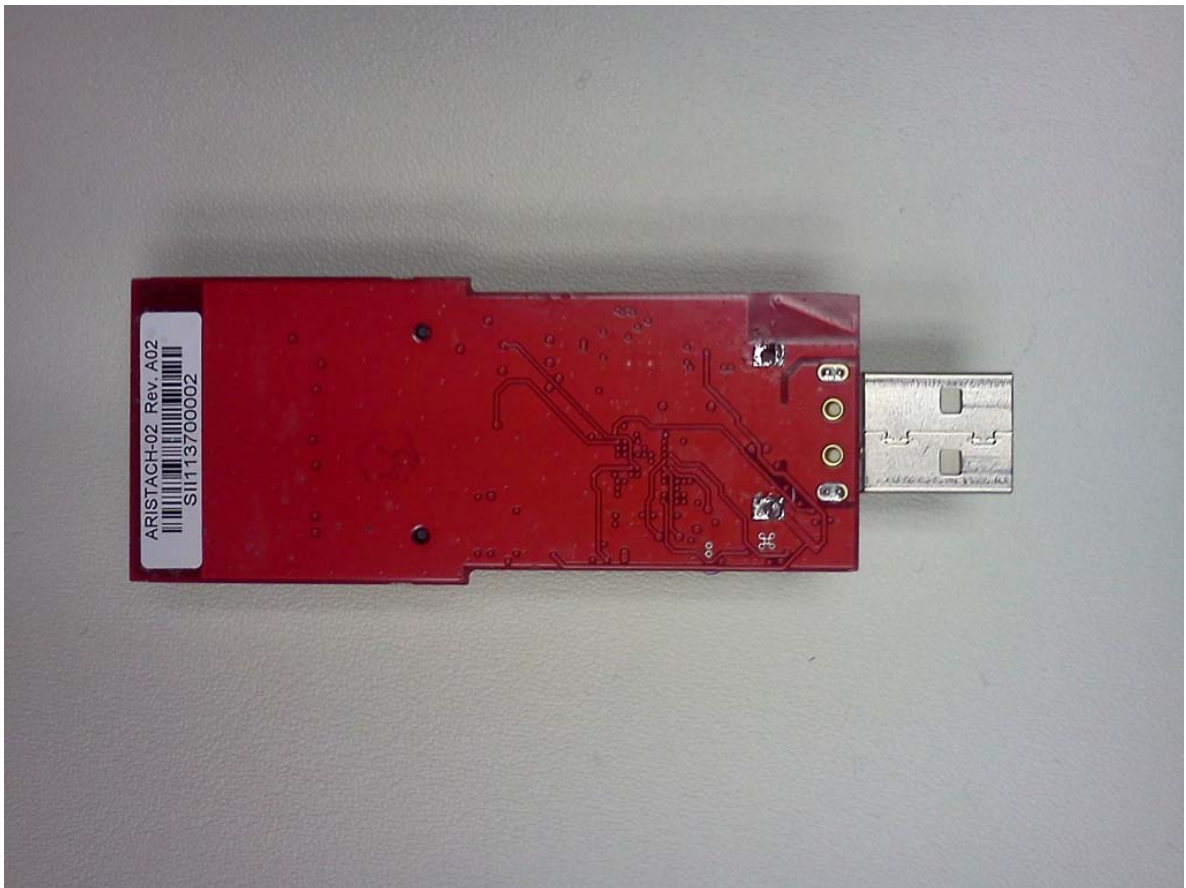
Bottom of Board: Without Battery