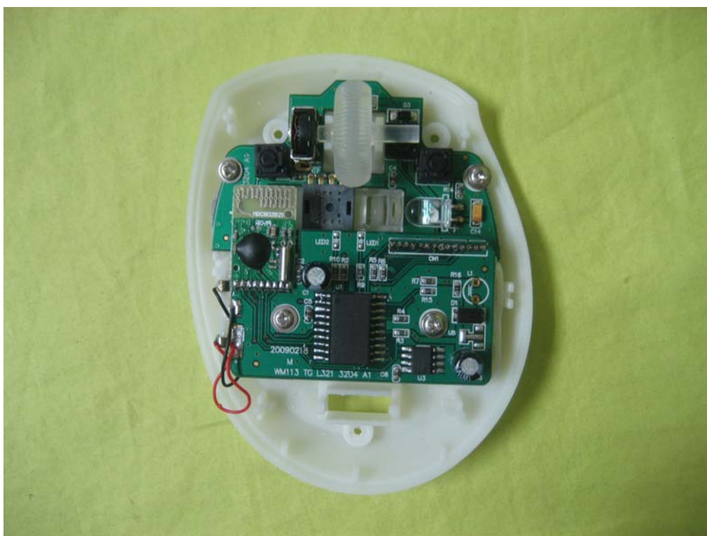
Uncovered View of EUT-2