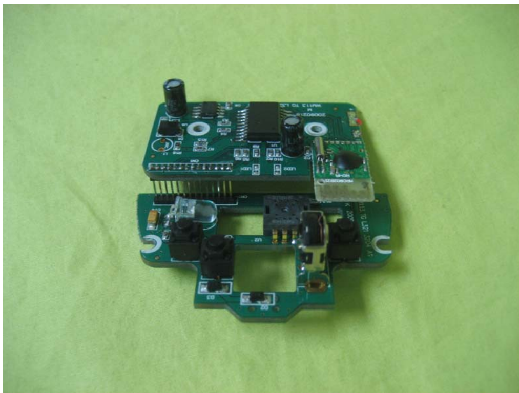
Front view of PCB1