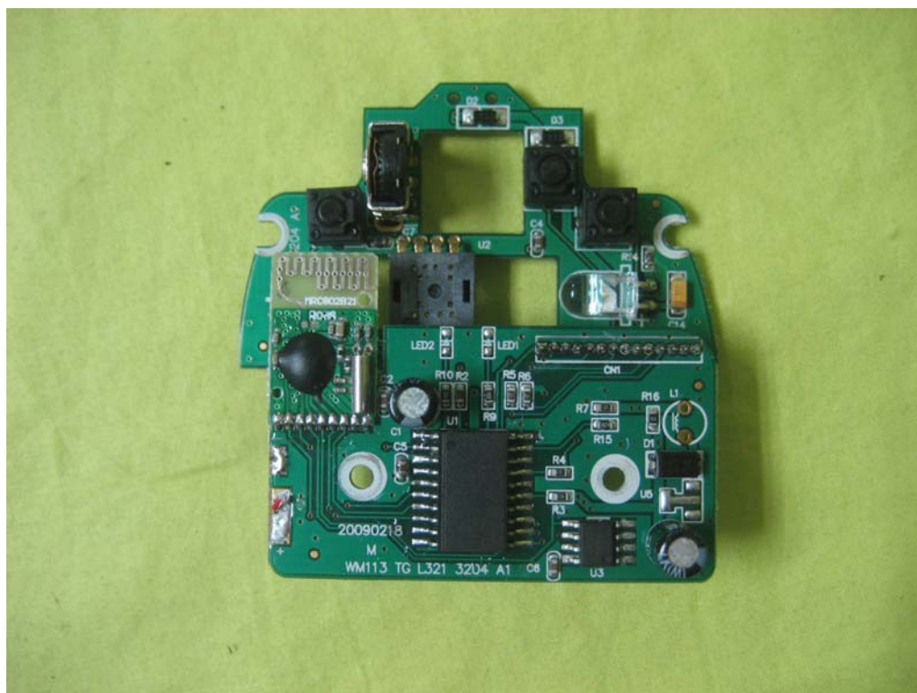
Top view of PCB1