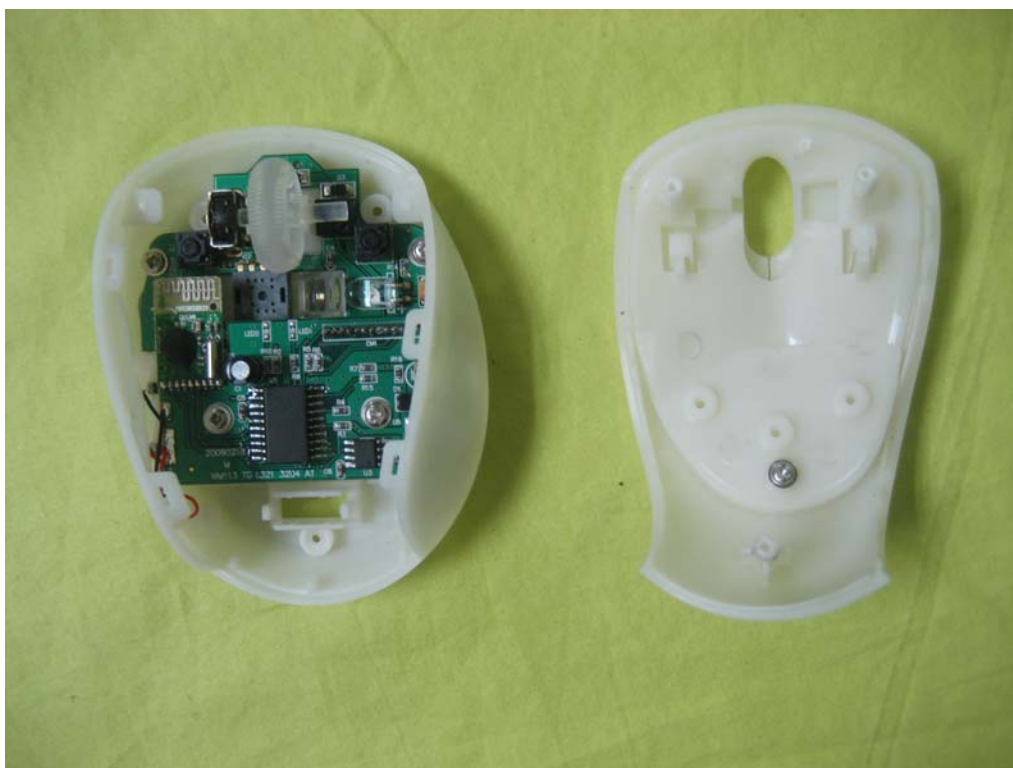
Uncovered View of EUT-1