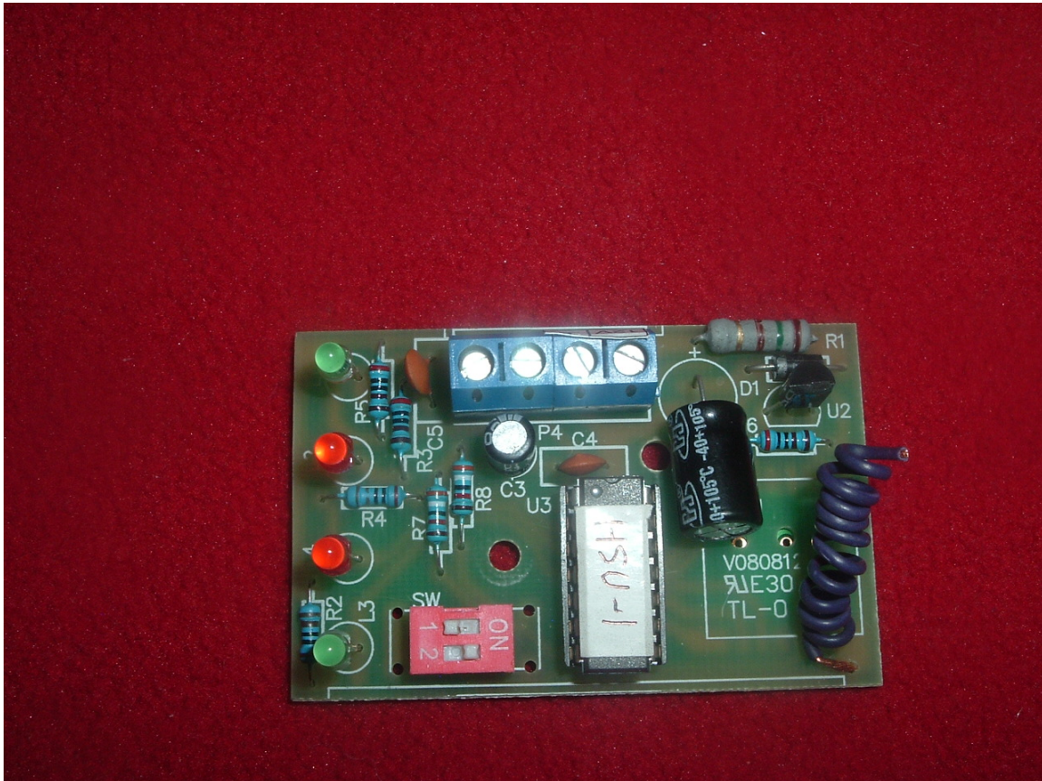
Figure 1. Component Side of EUT PC board