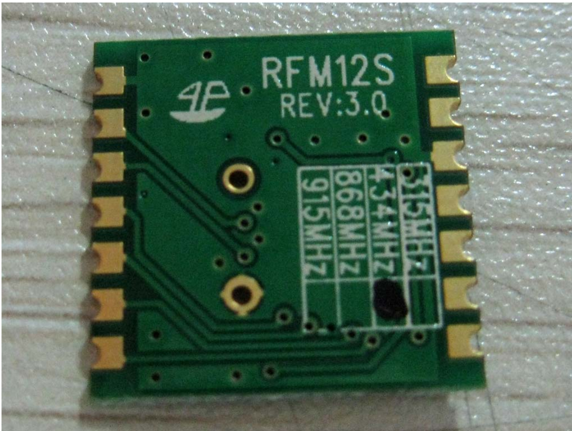
Figure 4. Module Bottom View

Application for Certification FCC ID: XRCVSI-FFZ2009 09-0126 Valve Solutions Incorporated HOPE RFM12 Module