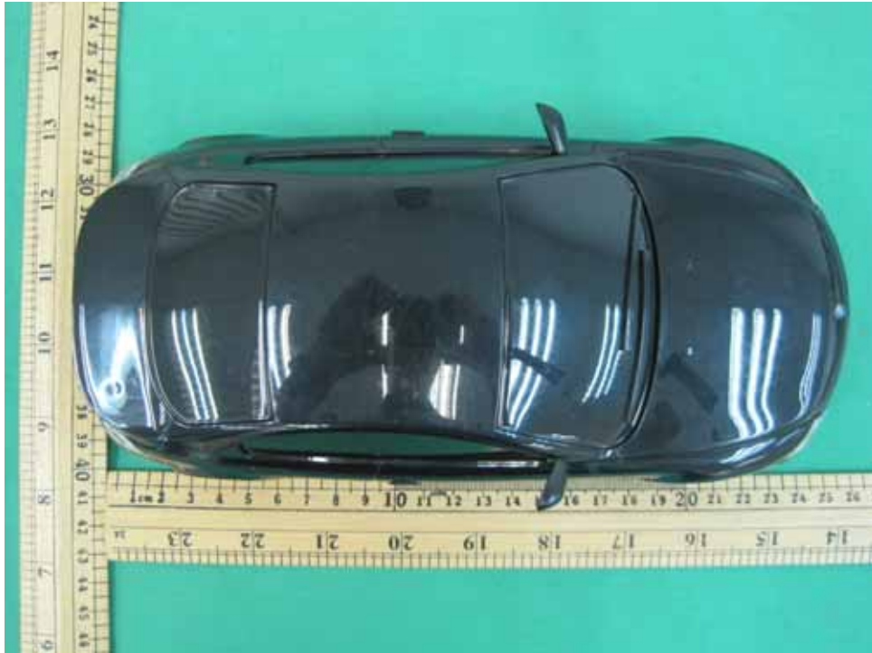
Photo of Sample