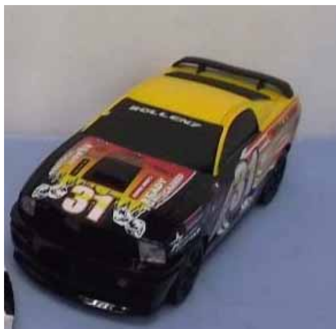
Model : 9983