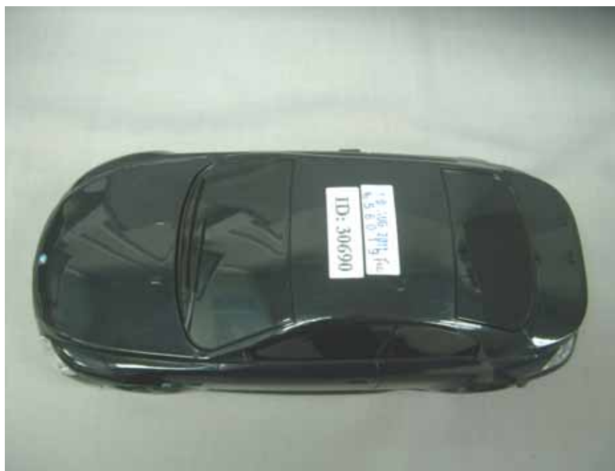
Model : 6387