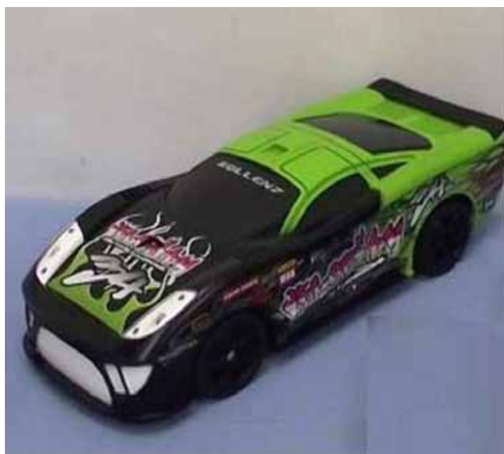
Model : 6386