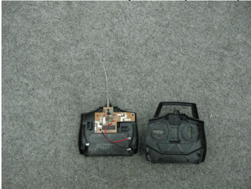
Front View of the product (Internal)