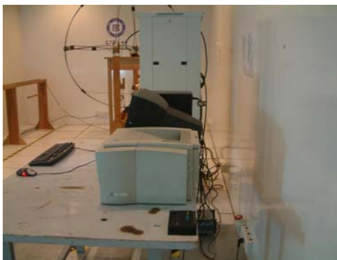
Side view of Conducted measurement

Copyright of this report is owned by Centre of Testing Service and may not be reproduced other than in full except with the written approval of the issuing Company.