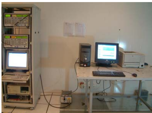
Front view of conducted measurement