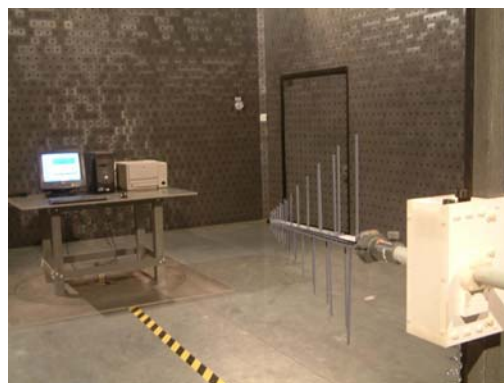
High frequency of Radiated measurement

Copyright of this report is owned by Centre of Testing Service and may not be reproduced other than in full except with the written approval of the issuing Company.