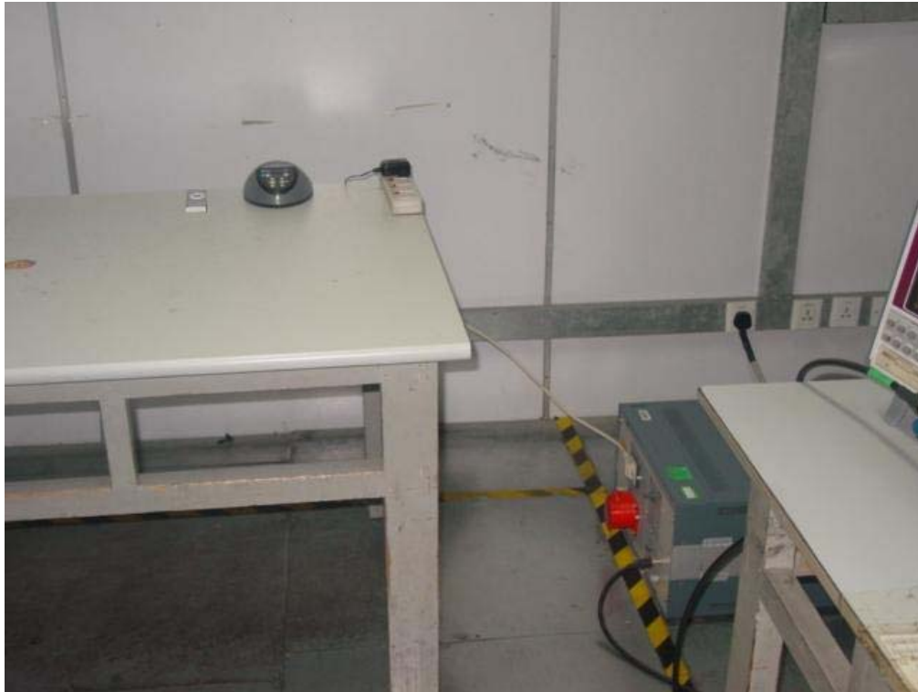
Set-up for radiated emission test (30MHz~1GHz)