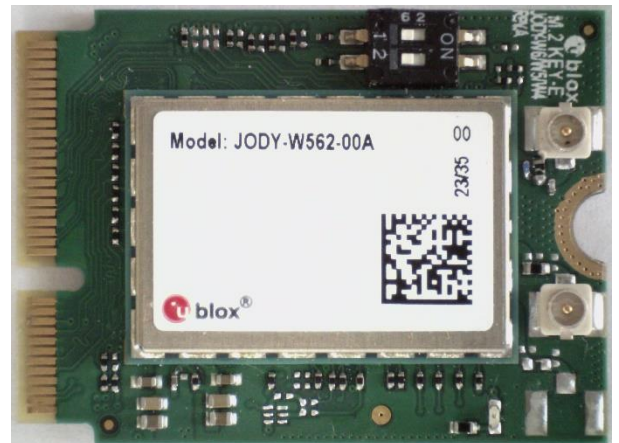
Figure 4: M2-JODY-W562 card top view external photo