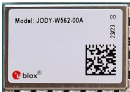
Figure 3: JODY-W562-00A module top view external photo