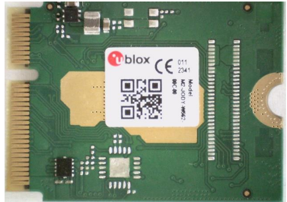
Figure 6: Bottom view of M2-JODY-W562 card