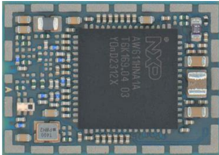
Figure 1: JODY-W562-00A module internal photo

Combination of left picture and below picture