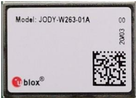
Figure 2: JODY-W263-00A top view external photo