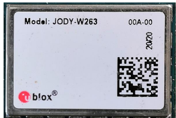
Figure 3: JODY-W263-00A top view external photo