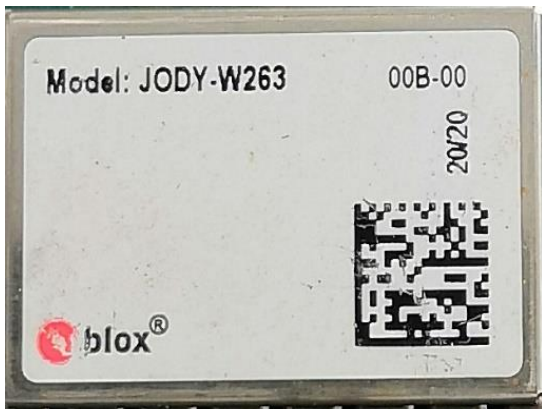
Figure 4: JODY-W263-00B top view external photo