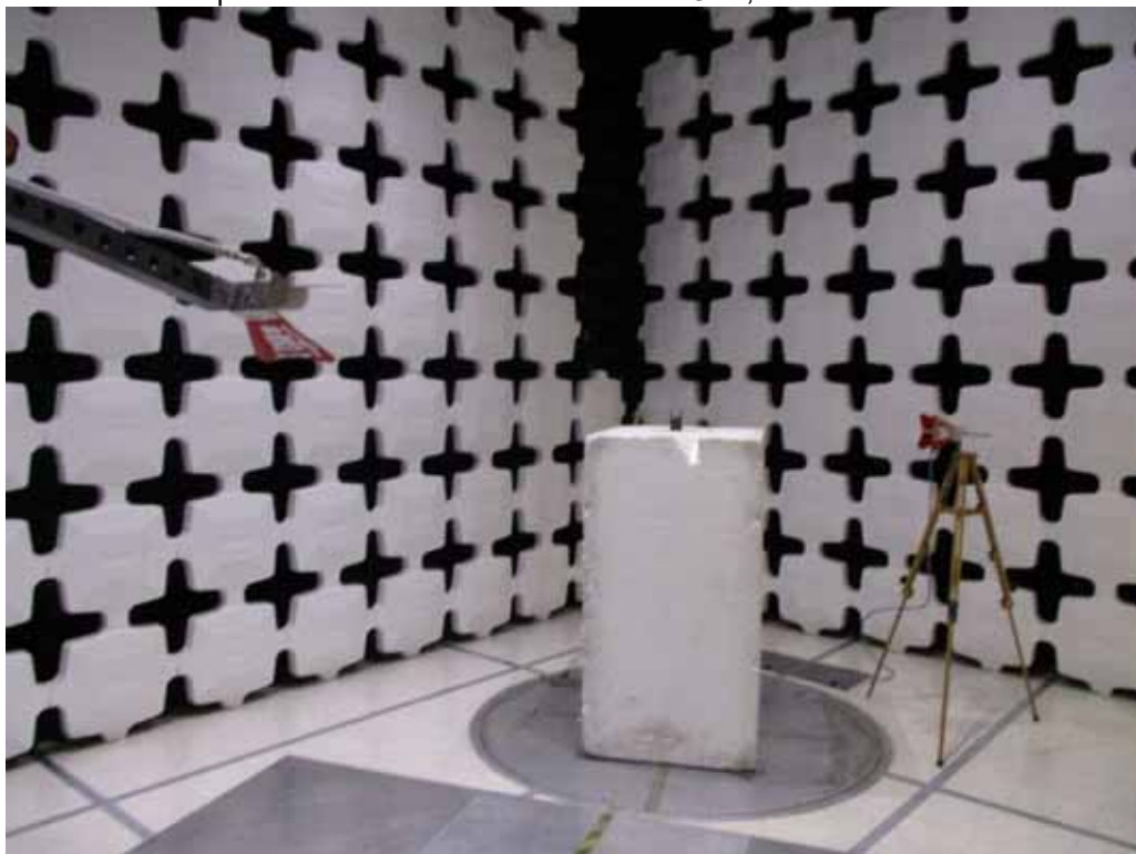
Test Setup for Radiated Emissions – Above 1GHz, Vertical Polarization