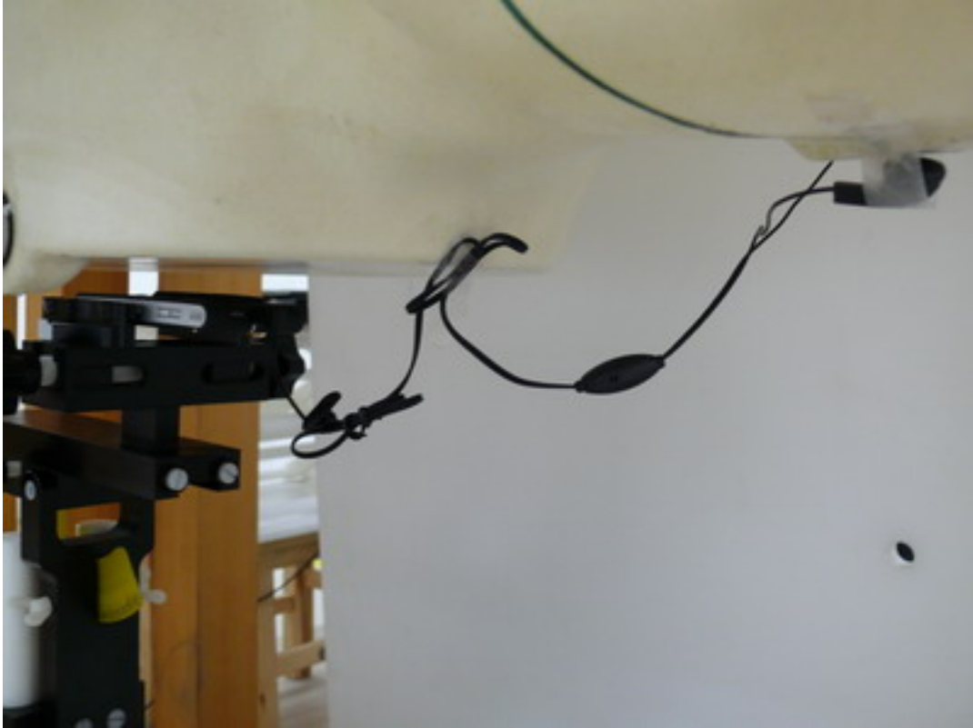
Picture 13: Body with earphone, The EUT display towards ground, the distance from handset to the bottom of the Phantom is 15mm)