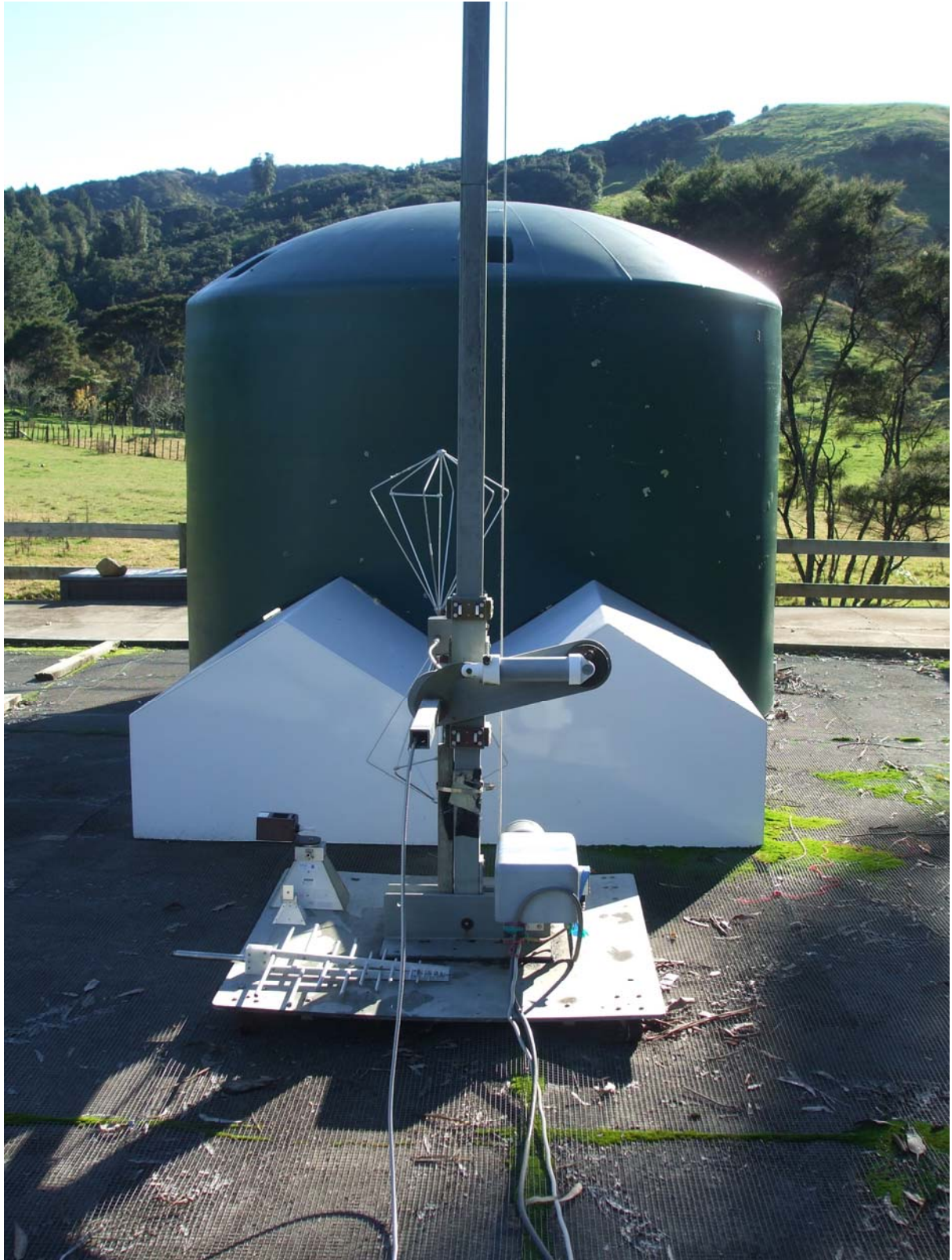
Schwarzbeck Biconnical Antenna (30 - 300 MHz)