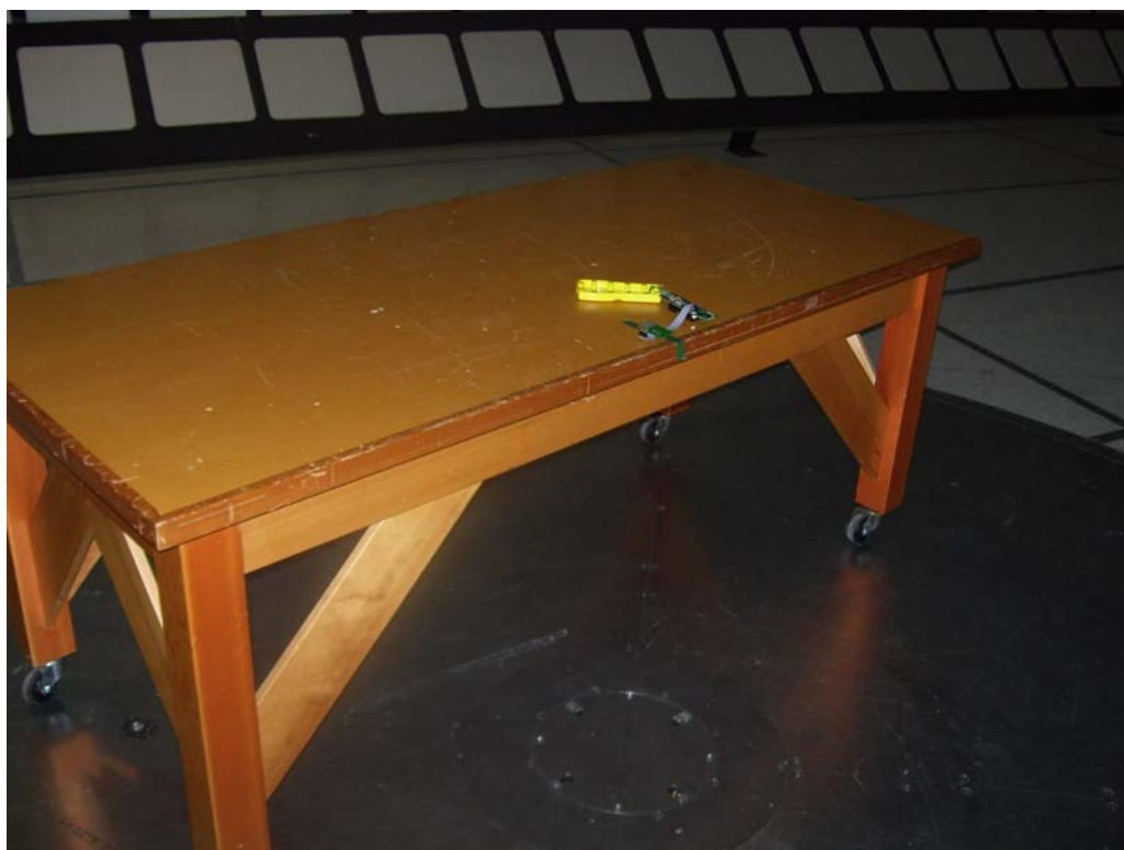
Figure 2 - Radiated Emissions Test Setup, Horizontal Position